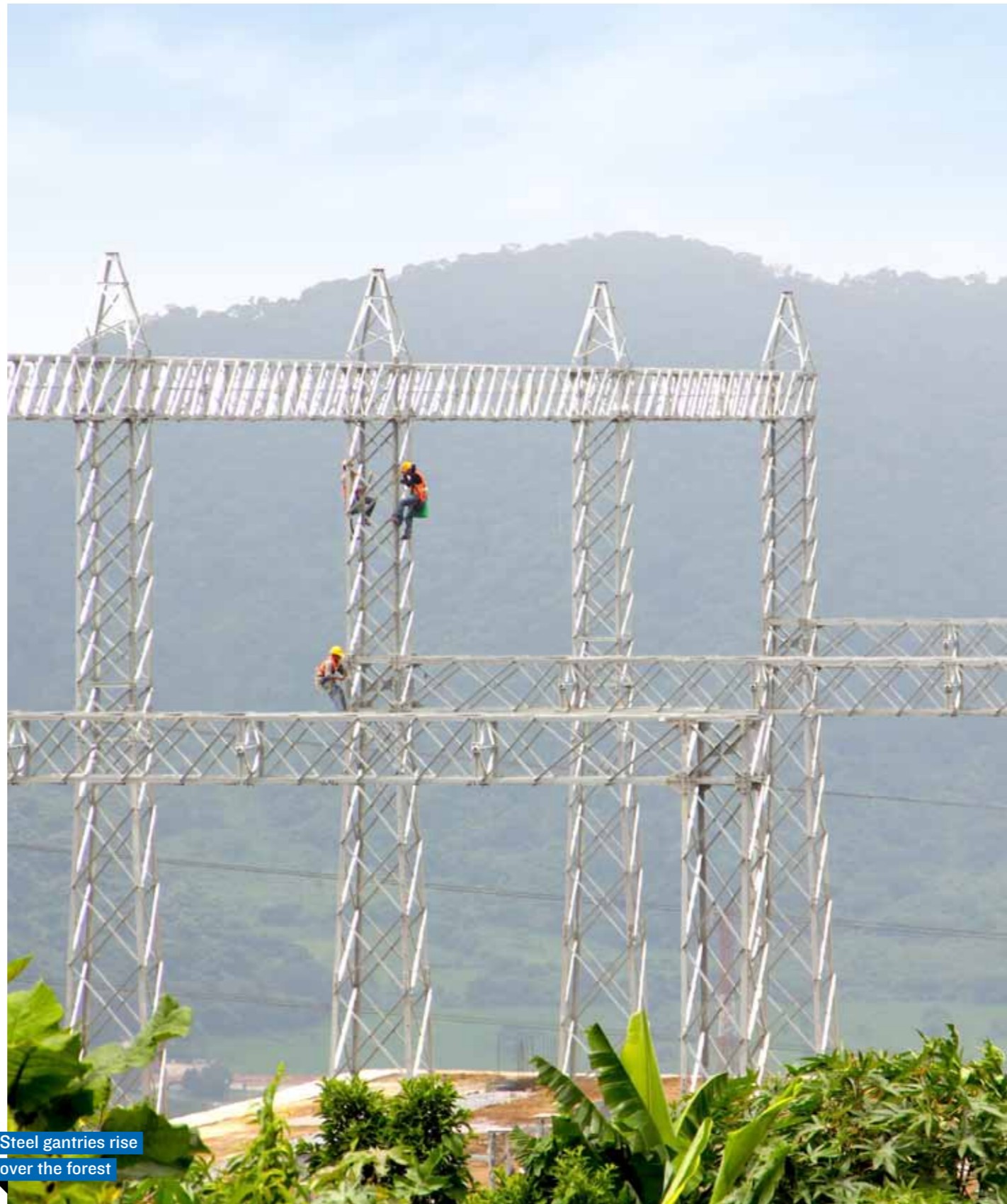
Steel gantries rise over the forest

"We are able to draw on the commitment and world-class practices of a business group with 117 years of experience in the electricity sector"