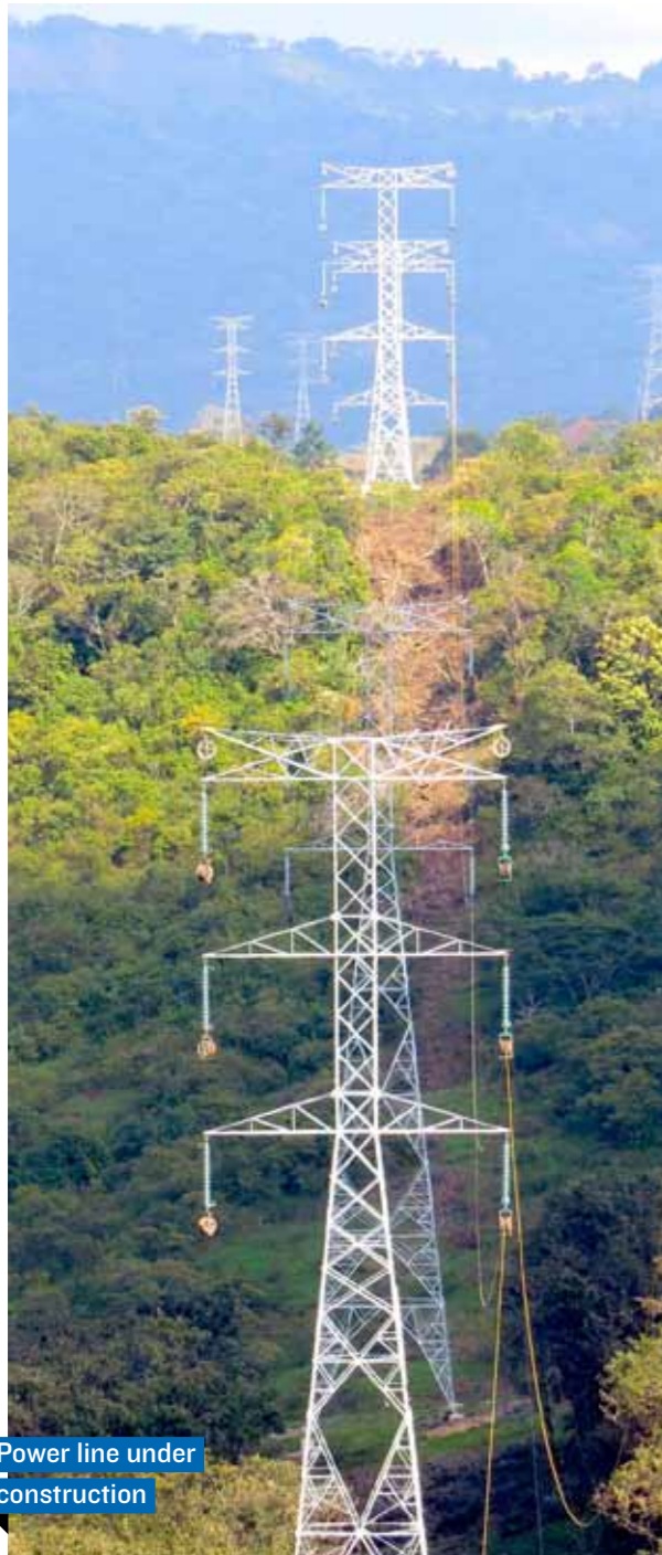
Power line under construction

task of helping people understand that access to electric power will transform their lives for the better. This is a nation-wide project and once it is built and in operation, it will benefit all families and companies in the country. However it has already generated around 4,000 direct and indirect jobs”.