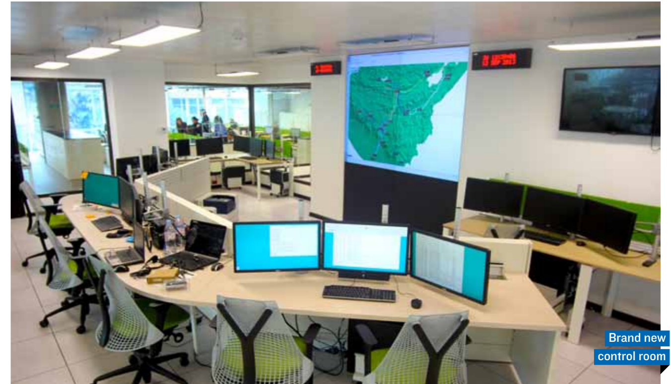
Brand new control room

Among the initiatives undertaken in the last four years are LED lighting and stand-by solutions that turn the system off