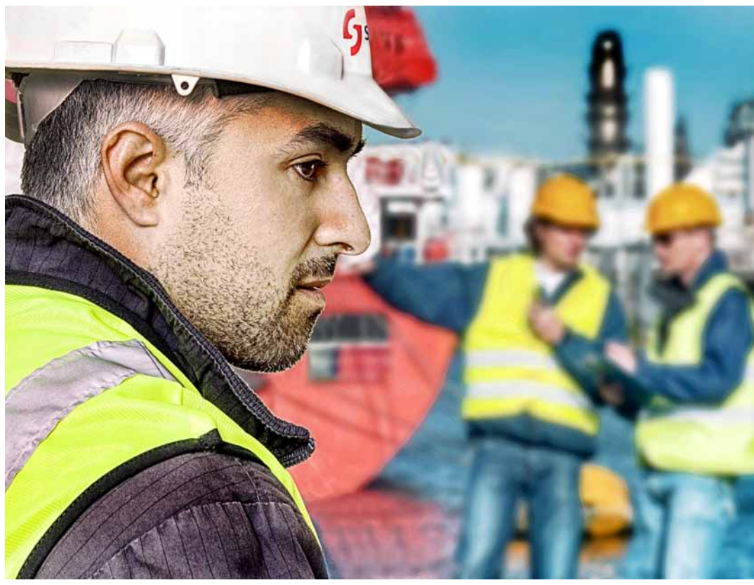
Overseeing work taking place