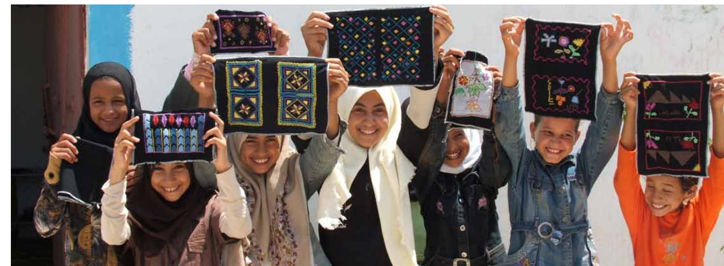
El-Gorah girls displaying embroidery pieces they crafted themselves. P&G supported El-Gorah's Community Development Association