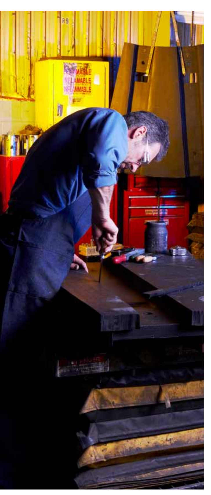
Mining hand lining