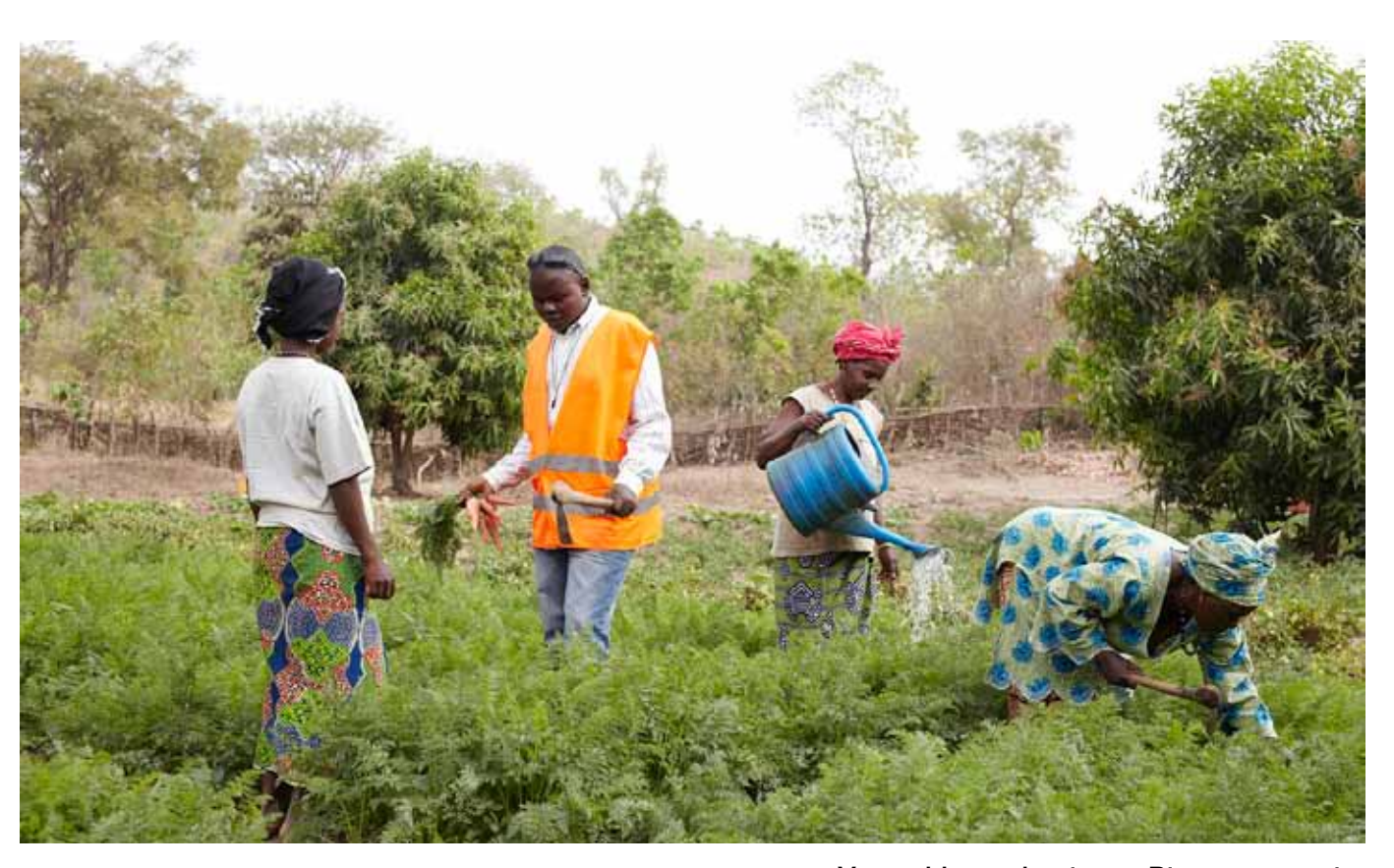
Vegetable production at Bissa community

standards, appropriate working conditions and industry-best environmental standards – our 10,000 strong workforce is the core of our success and deserves nothing less. throughout all areas of our African operations we try to employ local people