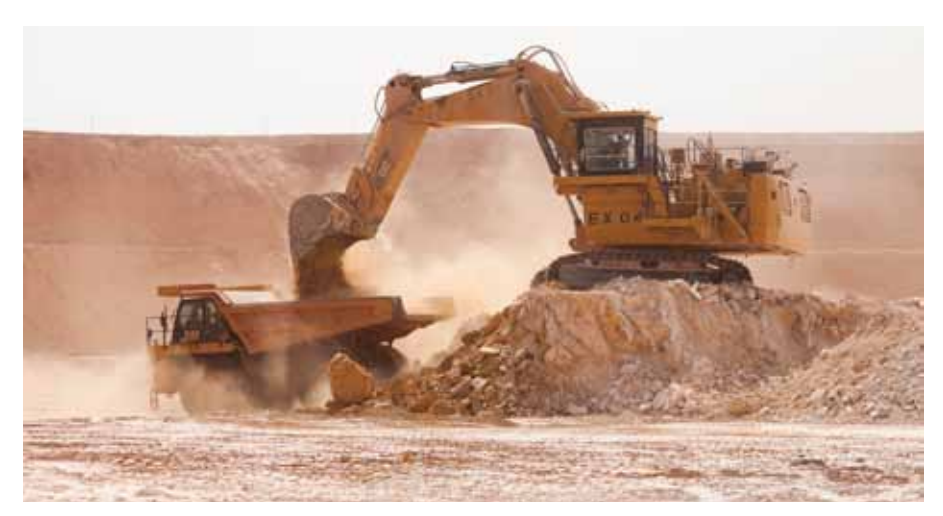
Open pit loading at Bissa

length of approximately seven kilometres and further exploration works subsequently conducted by Nordgold improved confidence further, demonstrating better reserves than previously anticipated.