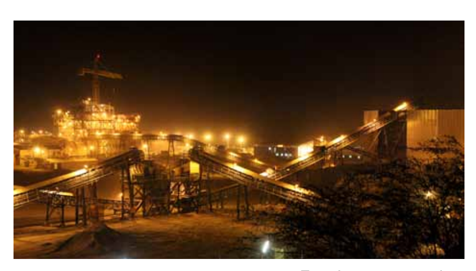
Taparko processing plant

minor lost-time incident in 15 months and all sites have teams of qualified HSE specialists in place, whose focus is to ensure that standards are consistently aligned with international compliance requirements.