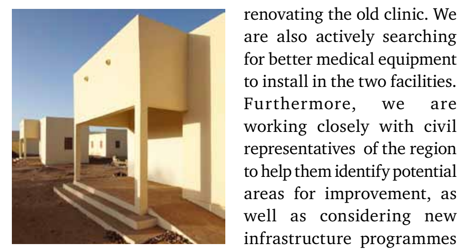
New homes in Burkina Faso

Taparko had already benefited from this approach, he continues: "We support the local school, including building new classrooms and providing drinking water for the teachers and children. We also support several other community projects aimed at helping local populations develop sustainable work