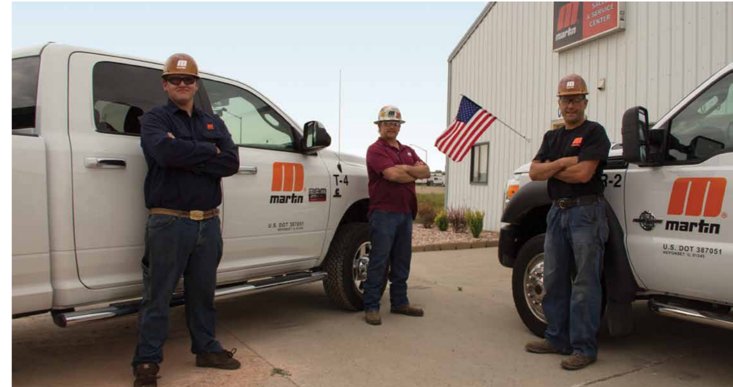
Martin opened a new service center in Gillette, Wyoming to provide factory-direct parts, sales and service 24-7 for the mining industry in Powder River Basin area

“AS MINING MAJORS GLOBALIZE THEY WANT TO WORK WITH SOMEONE WHO HAS REPRESENTATION AROUND THE WORLD AND WE ARE THERE WHEREVER THEY ARE”