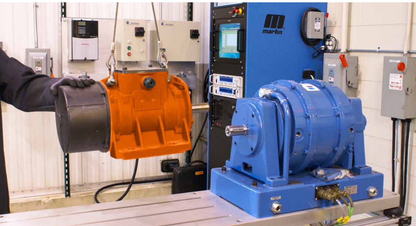
Martin's new capabilities include sophisticated dynamometer testing that allows the company to map the shape and values of an electric motor's torque curve