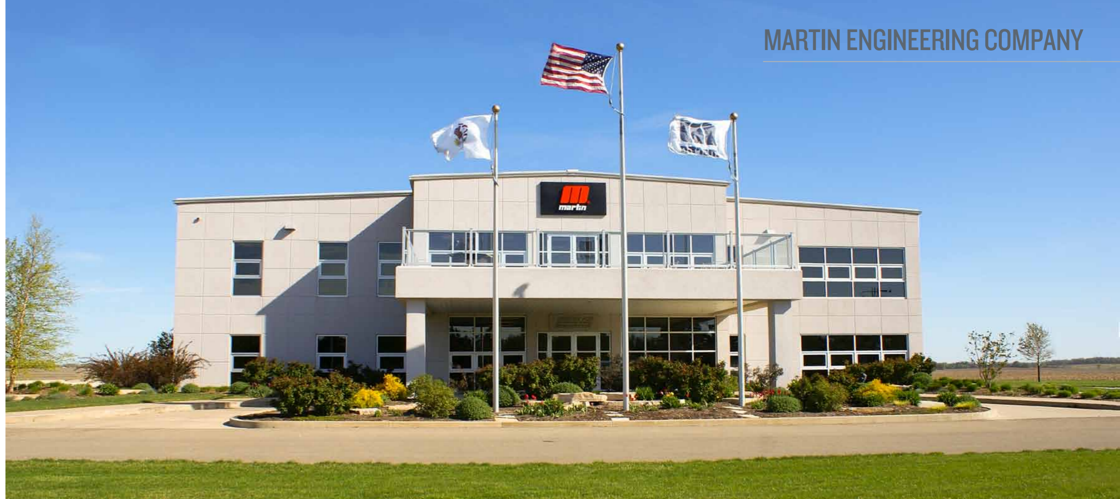
The Center for Innovation (CFI) at Martin's world headquarters in Neponset, Illinois