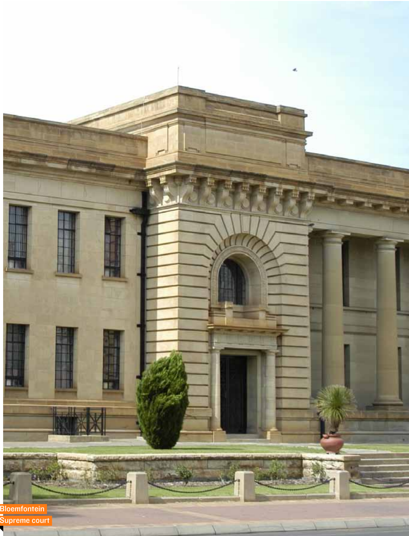
Bloemfontein Supreme court