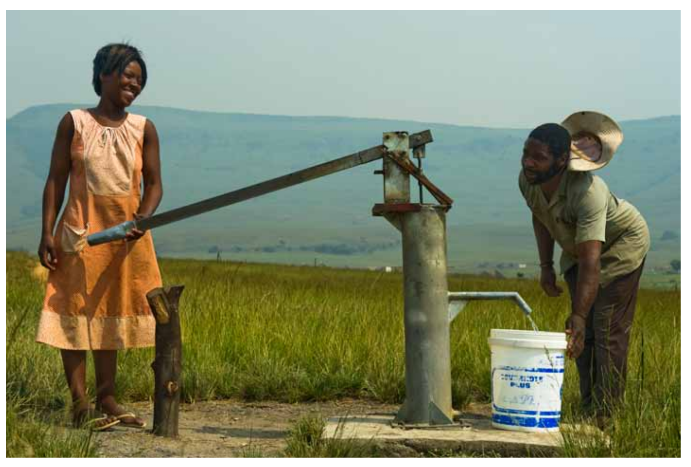
Jindal Africa's philosophy is to build strong and long-term relations with communities

Group is so well regarded that it is the dream of many simply to work for the organisation. What we want to do is recreate that same level of passion here in Africa. Yes we may be a relatively new company in the grade scheme of things, but we already believe that we have the tools needed to make this a very special place to work."