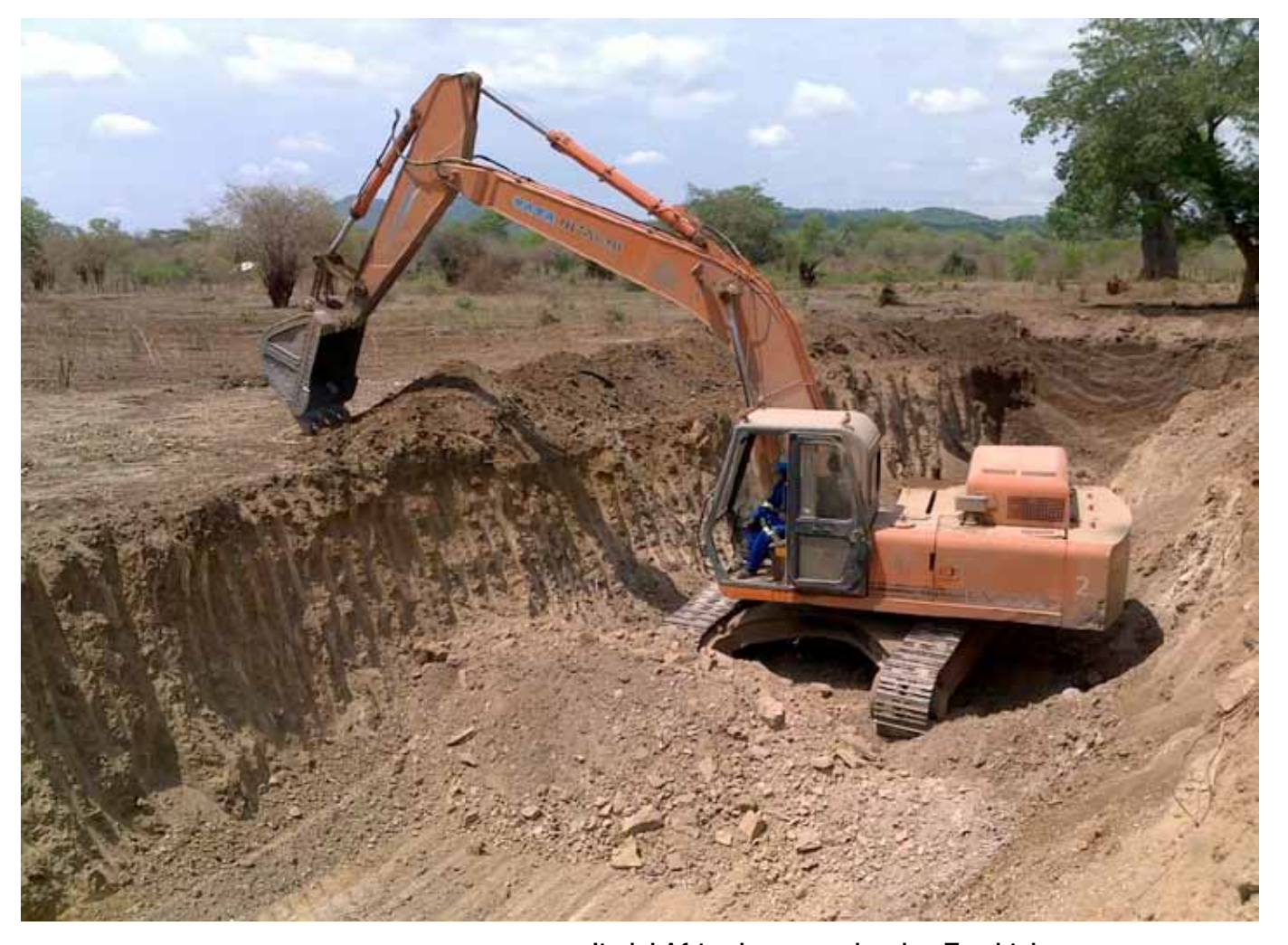
Jindal Africa hopes to develop Zambia's copper resources

Moatize region in the Cahora Basa district into the copper industry, where it is in of Tete province.