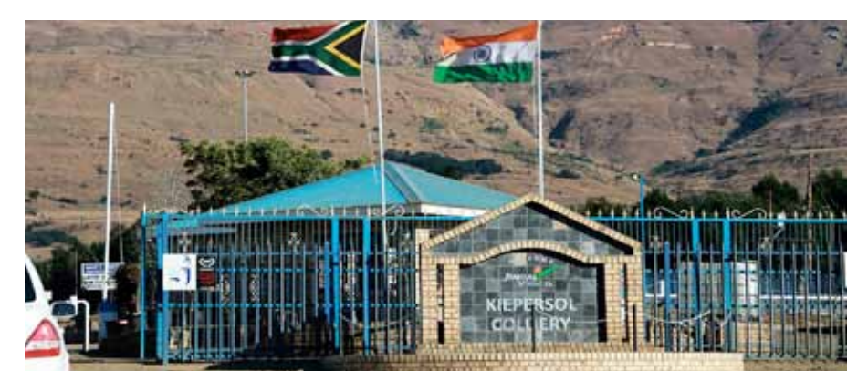
The Kiepersol Colliery, South Africa

The country's thermal-grade coal and significant coking coal reserves present a major opportunity for Jindal Africa to