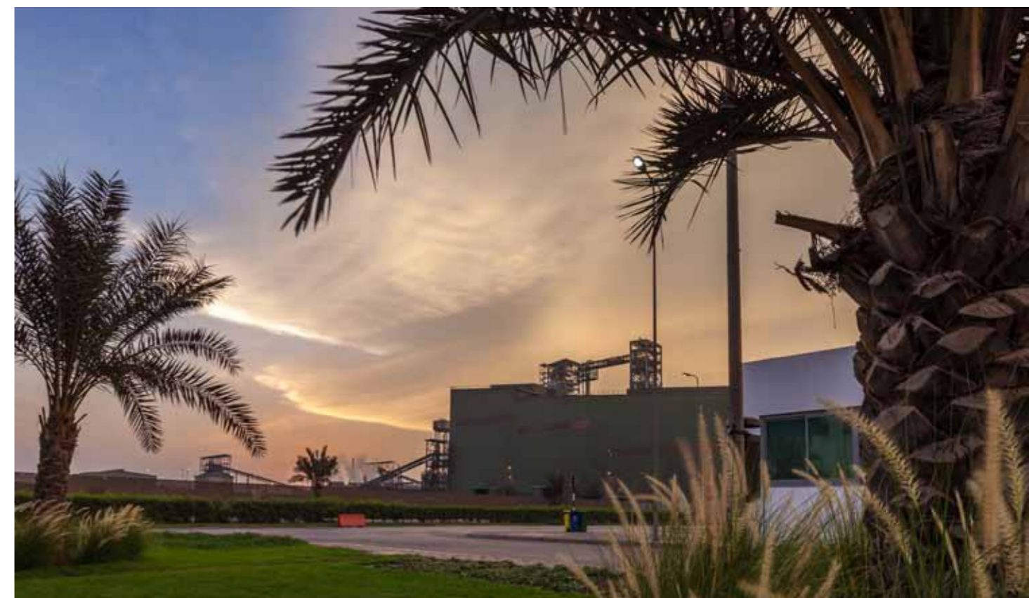
Monitoring the environment is a key priority

These involve conducting business in a socially and environmentally responsible manner, using best available techniques, preventing environmental pollution, having an environmentally friendly approach at all times and reducing the generation and accumulation of waste products. The result of these actions helps to reduce the impact on the environment from the company's production activities, while at the same time aiming to provide a favourable living environment for the UAE community.