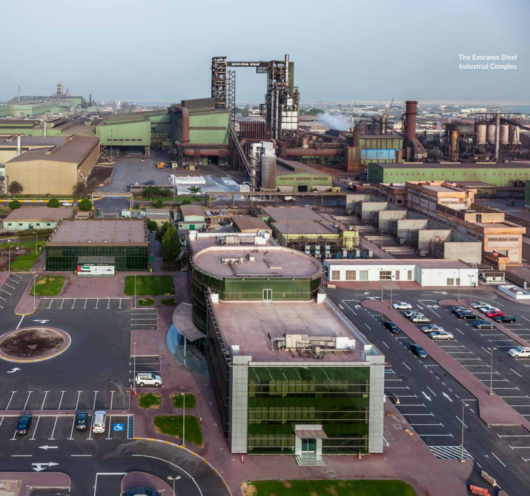
The Emirates Steel Industrial Complex

is planting 3,500 trees around the main boundary fence and surrounding its stockyard. In addition to enhancing the green areas, the project helps the company to control dust emissions from plant activity and improves road safety. It is also used as a bunker for more storage space and as a controlled area for materials. The long-term plans of Emirates Steel from an environmental perspective revolve around building on the impressive efforts it has already made. Naturally this will involve an increase in environmental investments, which will enable the company to rank among the best GCC companies in terms of environmental protection, thus strengthening its competitive advantage and contributing to its own sustainable development.