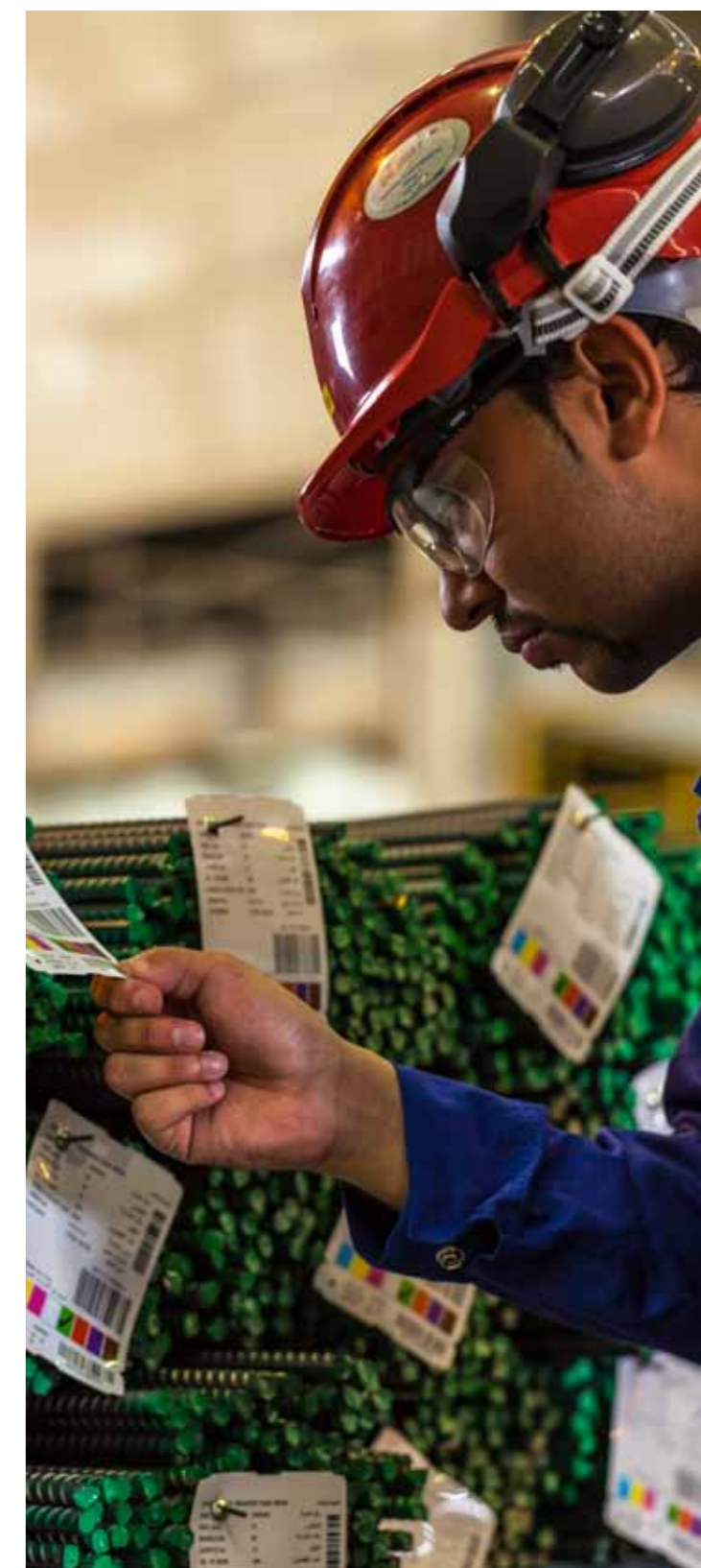
4th steelmaker in the world licensed to manufacture nuclear grade steel

This is far from the first time that gas has been pumped underground to improve oil recovery, and in the past the UAE has used surplus hydrocarbon gases for this purpose. However, with the nation's rise in its energy demand, this CCUS project will allow the UAE to preserve its natural gas for domestic electricity generation. The feed from the Emirates Steel plant, containing 90 per cent CO 2 , will be transferred to a common compression and dehydration facility at the project site in Mussafah. The feed stream will be compressed into dense phase; delivering a CO 2 stream through 50 kilometres of pipeline network, to be injected in an onshore field, operated by ADCO. It is worth noting that