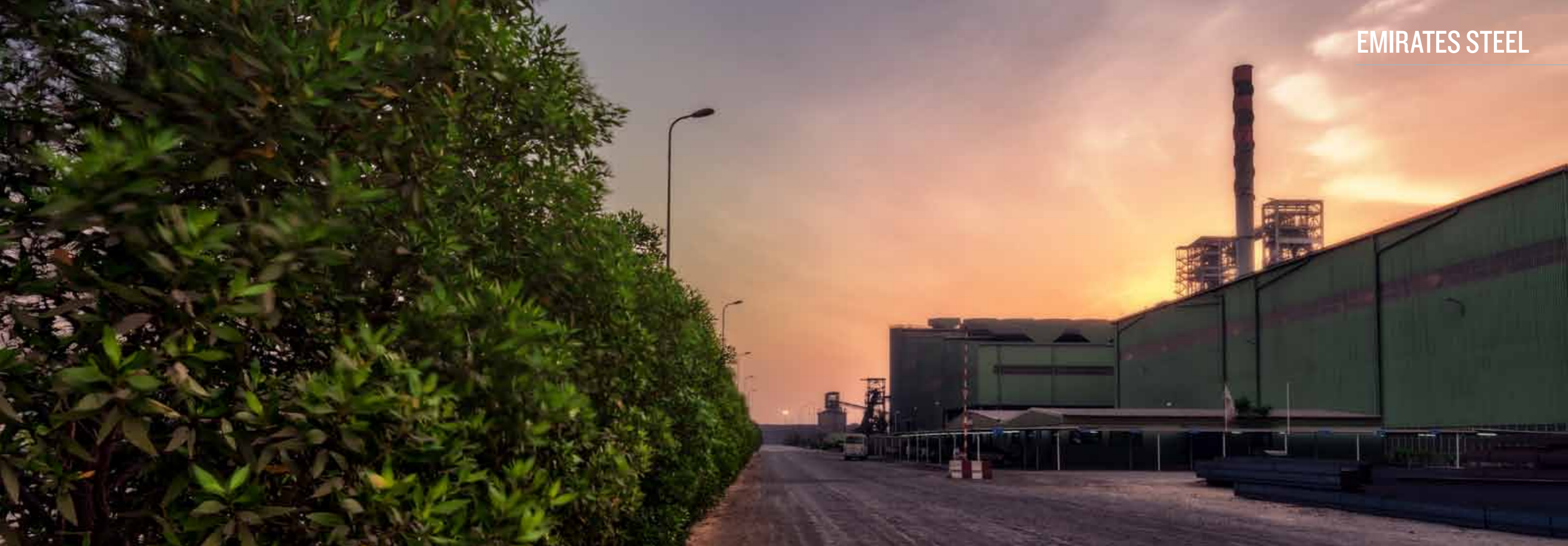
Green belt project: A responsible business