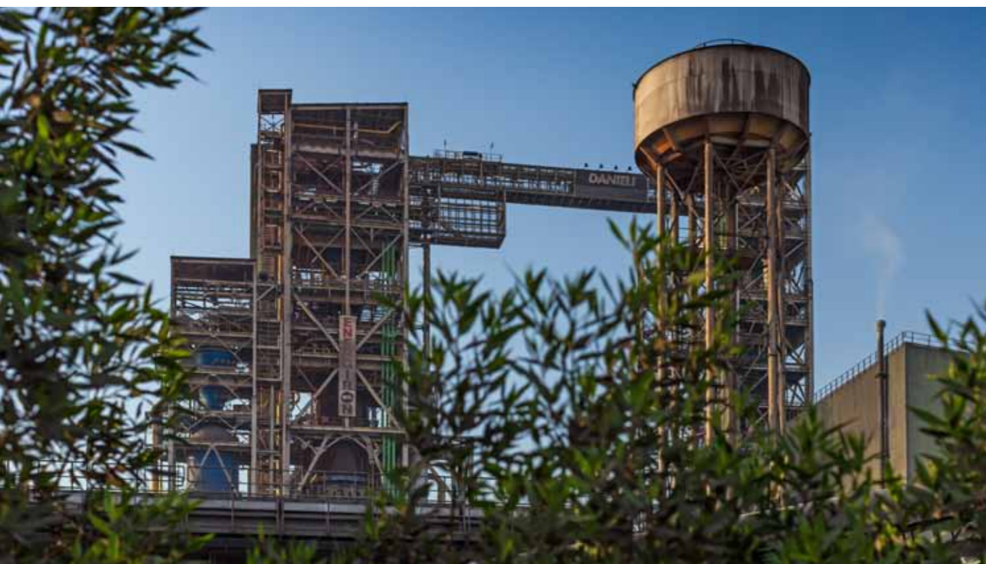
3,500 trees to be planted all around the steelmaking complex

“EMIRATES STEEL IS THE FIRST STEELMAKER IN THE WORLD TO CAPTURE ITS CO 2 EMISSIONS ON THIS SCALE OUTSIDE NORTH AMERICA”