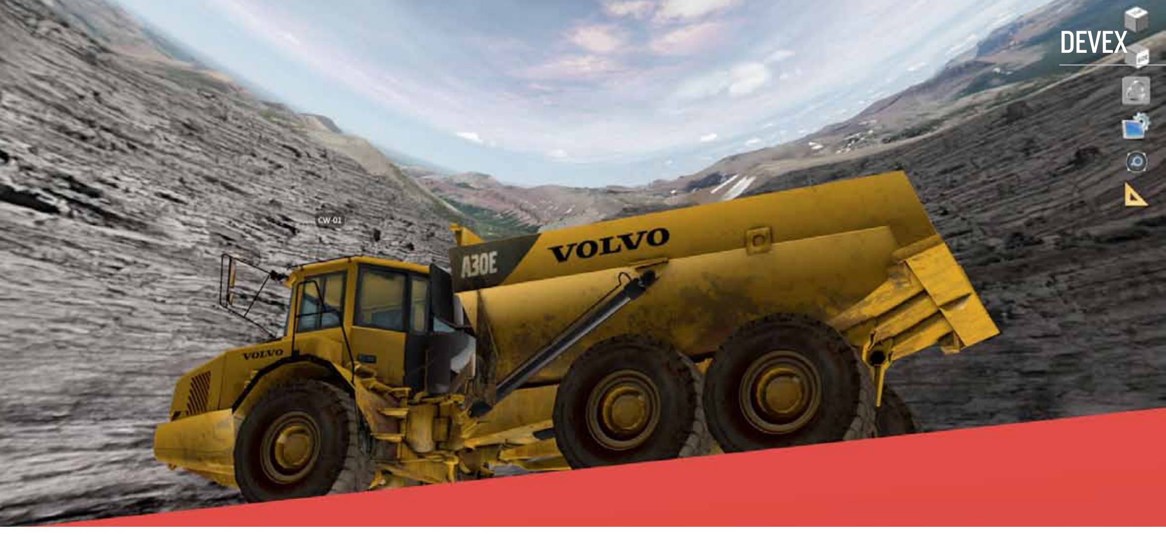
SmartMine|UG system screen

You can either migrate to Extreme across the board or bolt it on to the legacy system. Its open and extensible architecture represents a completely new approach to mine automation,