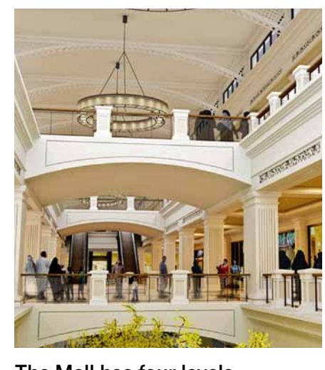
The Mall has four levels

visitors through its doors each year. The eye-catching landmark building extends over four levels, including an extensive parking facility for over 3.000 vehicles. Modelled in an elongated H shape, each end of the building houses the key anchor outlets for both retail and entertainment. The French hypermarket chain Carrefour is scheduled