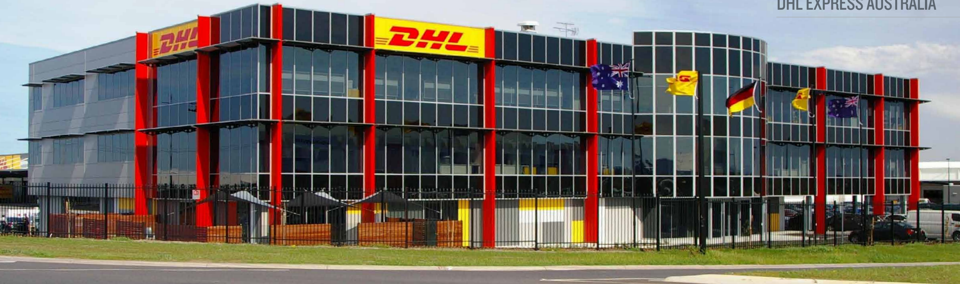
DHL facility at Melbourne