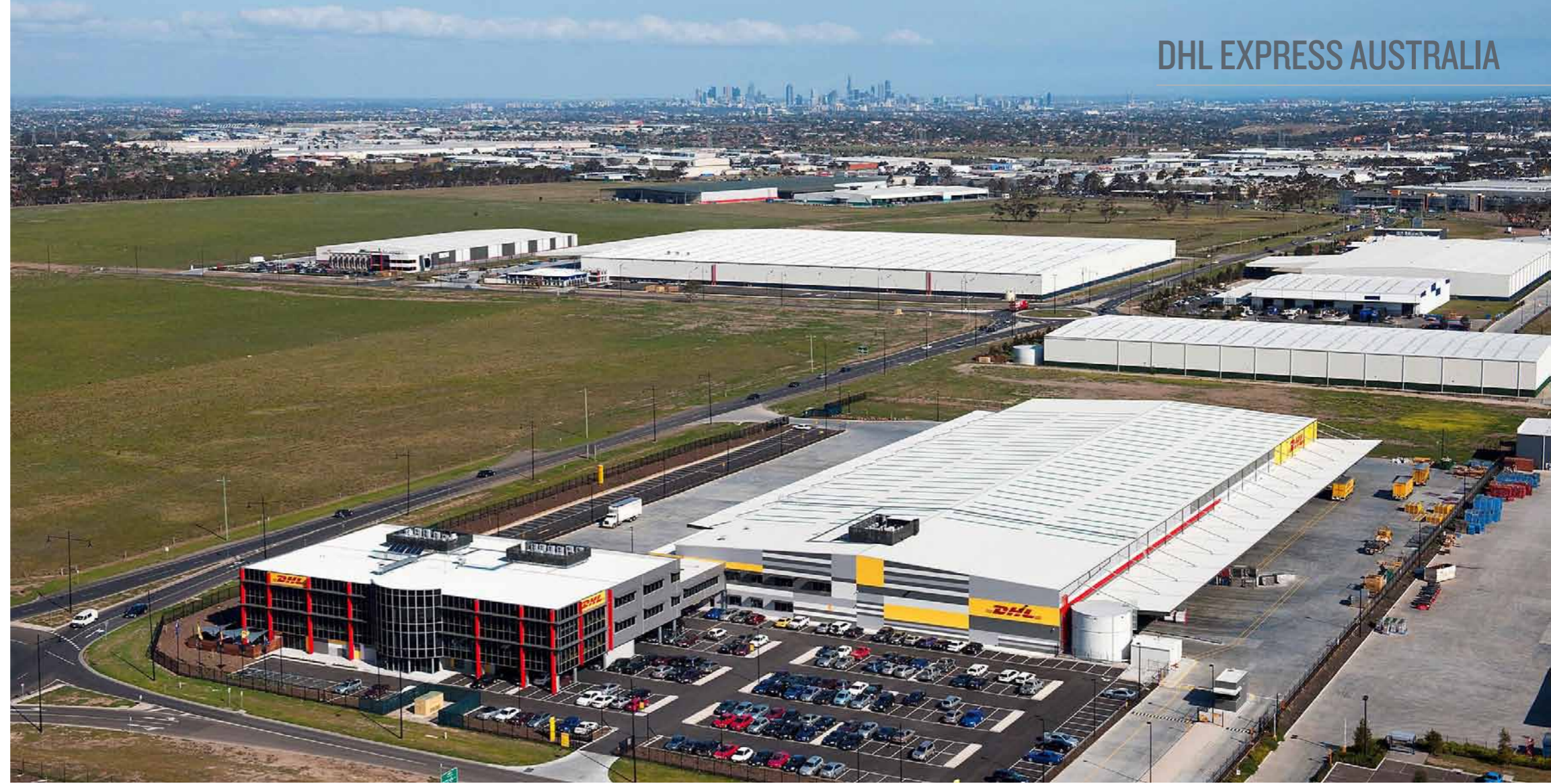
Airfreight facility, Melbourne

DHL Express Australia deals with a range of global businesses in the medical, aeronautical and fashion sectors, providing express and just-in-time delivery of items as diverse as clothing, car parts and contact lenses. Freight arrives by air from China, Europe and the rest of the world and is then dispatched to service centres, which undertake final deliveries. The