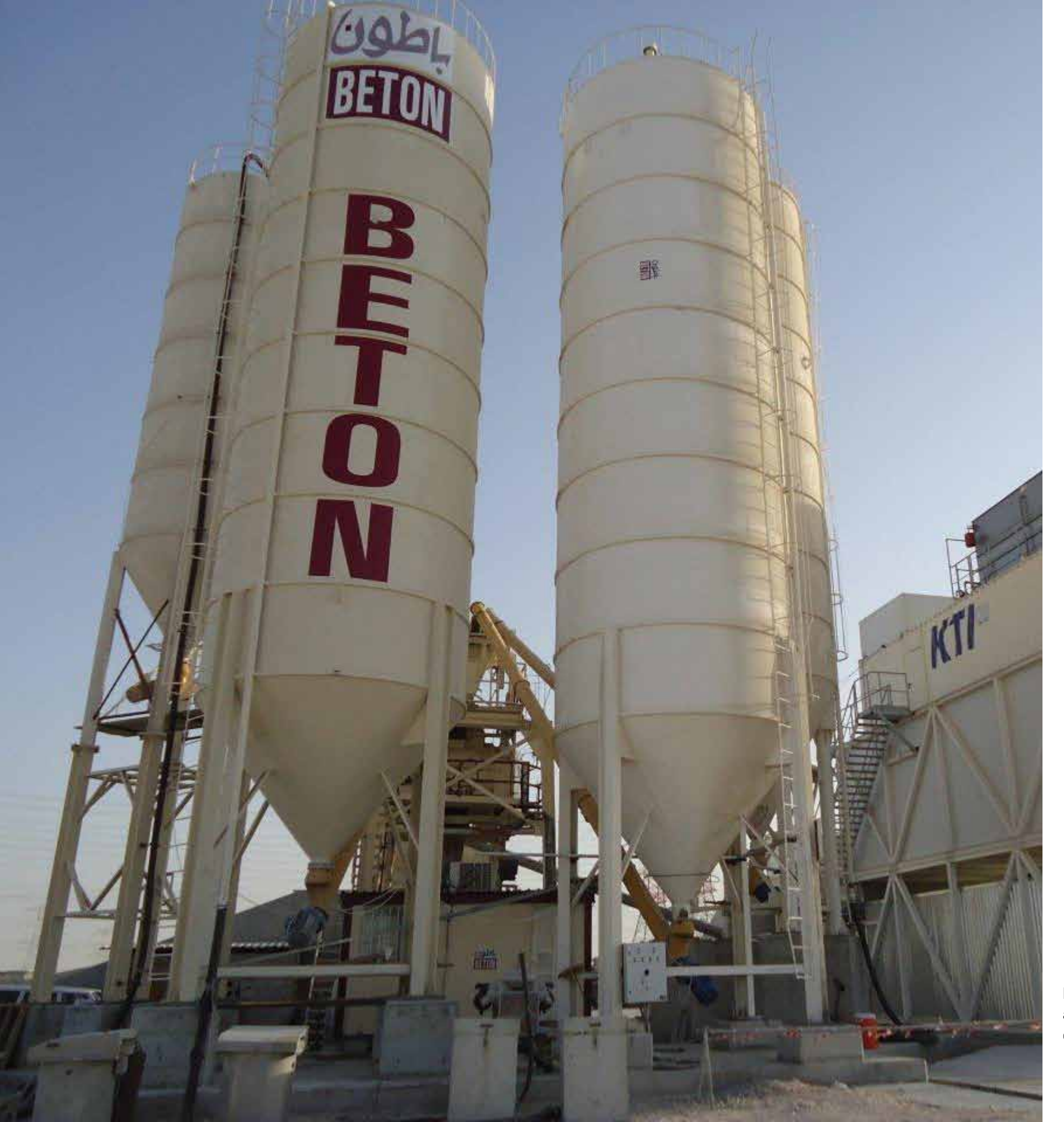
Batching plant and KTI ice and chiller plant

atar is undergoing a remarkable period of construction and development as it prepares to host the world's most prestigious sporting event—the 2022 FIFA World Cup. Millions of visitors from around the world will flock to this iconic Arab state and already the first wave of World Cup-oriented construction is underway. Over the next few years construction will begin on the football stadiums and hotels to house the influx of sports people and visitors.