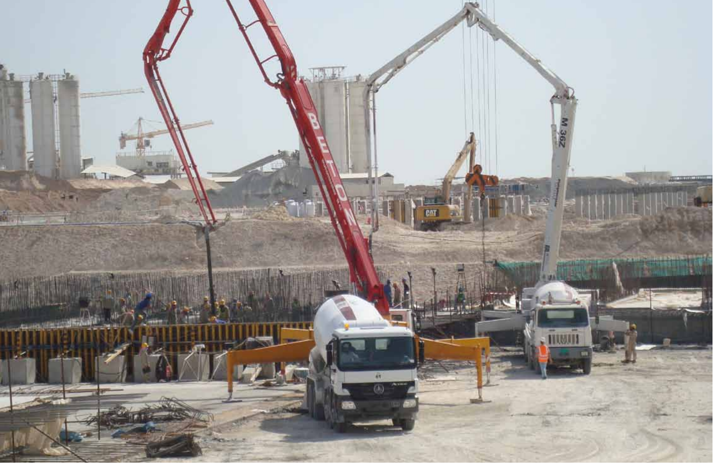
Beton is a tier one contractor and service provider to the construction industry

into upgrading the network of highways across the country, and these are either in the planning or construction phase. New harbours and ports are in progress, a new international airport is under construction and a new sewerage system is being laid. In a few years, once the infrastructure is completed, construction will begin on