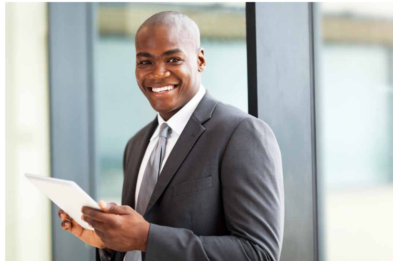
Business Connexion Group is Africa's leading black-owned ICT services provider

©2012 NetApp. All rights reserved. Specifications are subject to change without notice. NetApp, the NetApp logo, Data ONTAP, and Go further, faster are trademarks or registered trademarks of NetApp, Inc., in the United States and/or other countries. All other brands or products are trademarks or registered trademarks of their respective holders and should be treated as such. Headline source: NetApp internal estimates, June 2012: VNX, VNXe, Celerra NS can run any of Flare and Dart Operating Systems. Contribution of these products to the OS share has been estimated based on the proportion of NAS and SAN installations in these products (NAS – Dart; SAN – Flare).