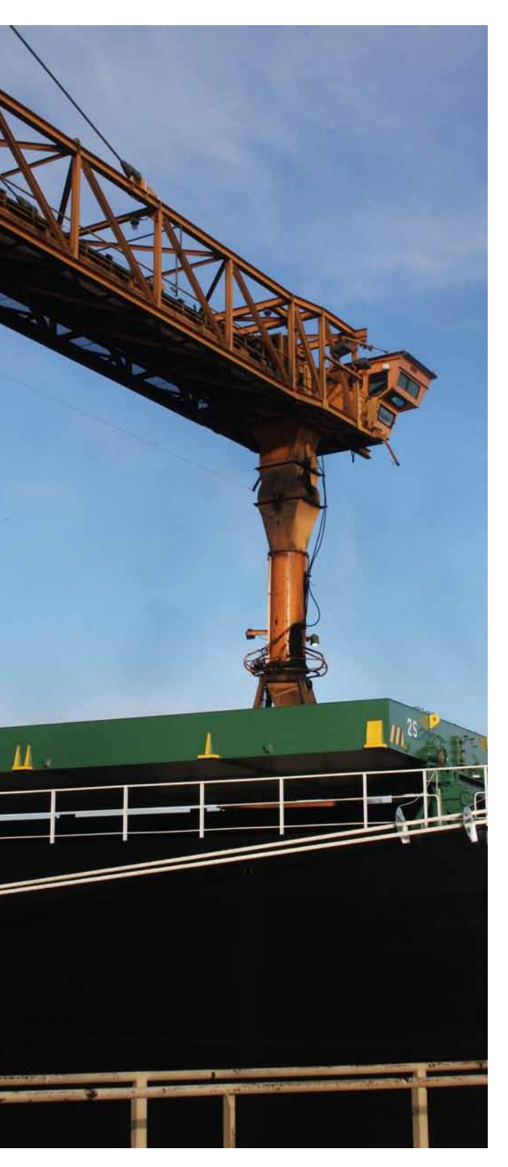
Ships up to 170,000 tonnes can be loaded at Berth 2

for a business to have to turn away so much potential income, but Westshore is approaching maximum efficiency as an operation, which is cause for congratulation. "Rail car dumping was our bottleneck, but following the installation of a new dumper and ancillary equipment, we are now more or less right-sized."