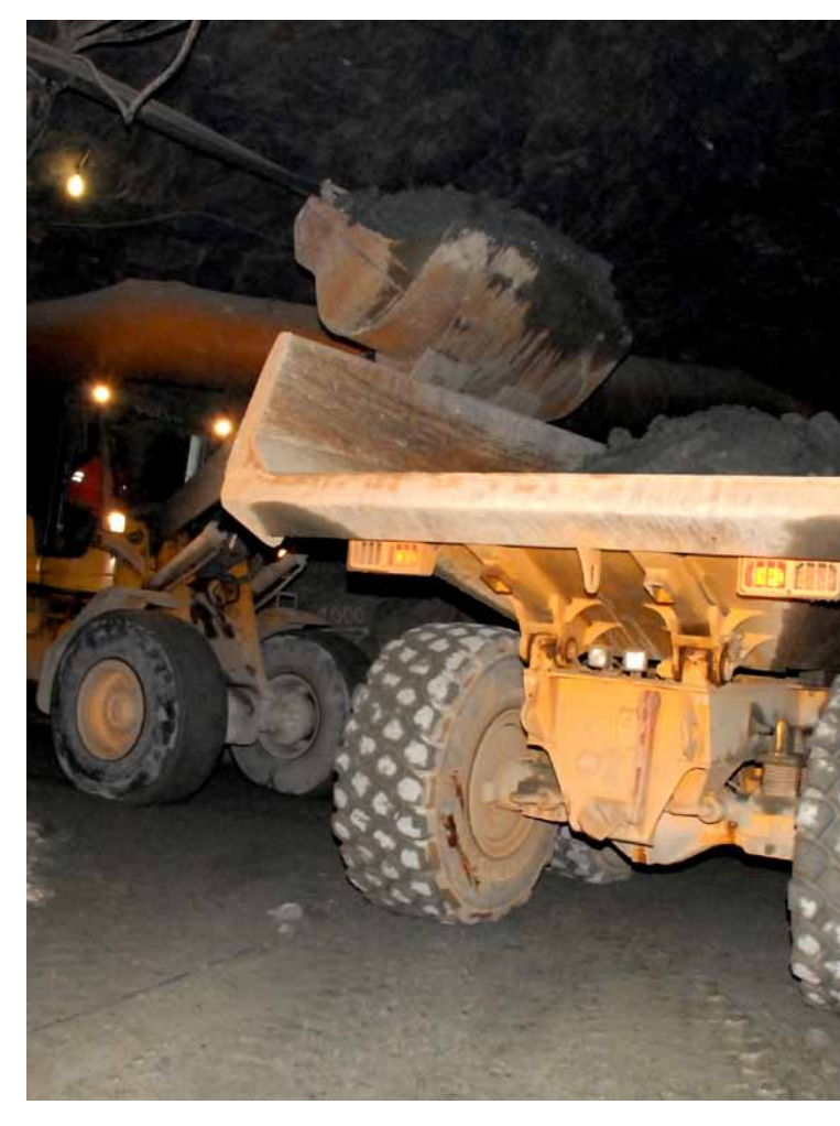
Loading ore underground - Andorinhas, Brazil