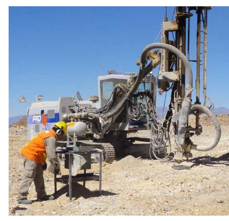
Production drilling - Kamila open cut

"WE HAVE ENOUGH KNOWN TARGETS SHOWING ANOMALOUS GOLD TO KEEP US BUSY FOR THE NEXT THREE YEARS"