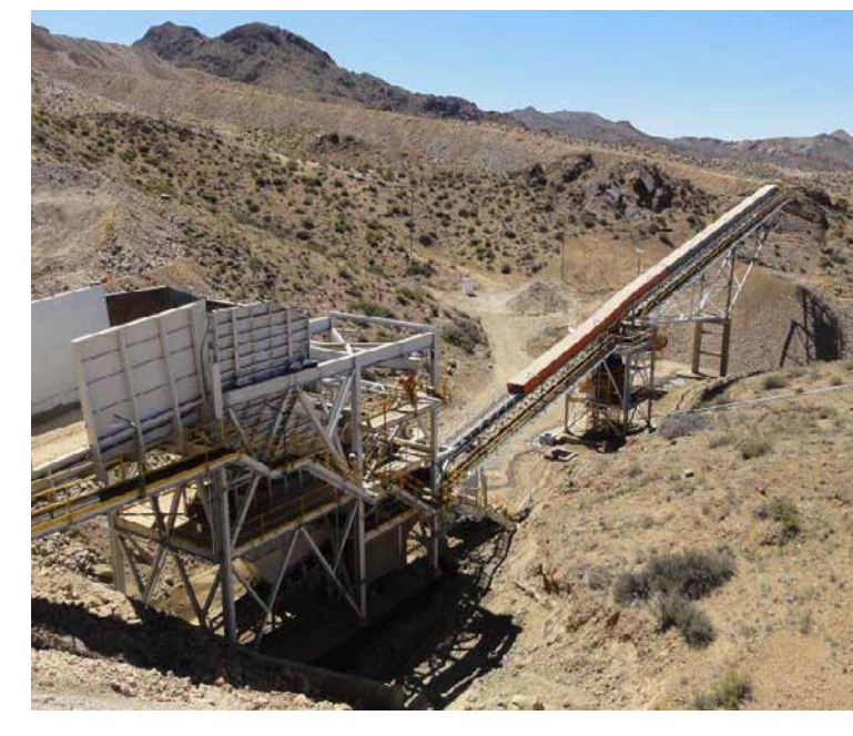
Primary crusher and live ore stockpile

Casposo, however, has been a technically interesting project and the increase to full production has been delayed. Not only has the complexity of the process been increased by the addition of a Merrill Crowe circuit to recover the silver present in the ore, but the