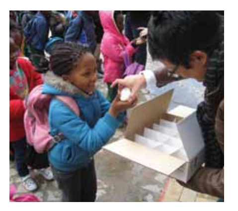
The Spur Foundation working in the community

As evidenced in the past with other major restaurant brands, in taking a business and making it multi-national, one does run the reason that we always strive to serve our