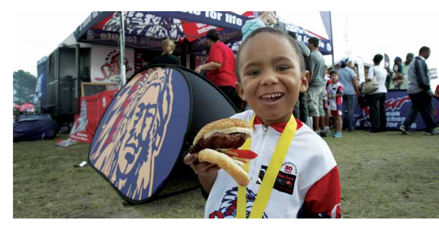
The Spur Foundation's emphasis is on nourishing and nurturing children