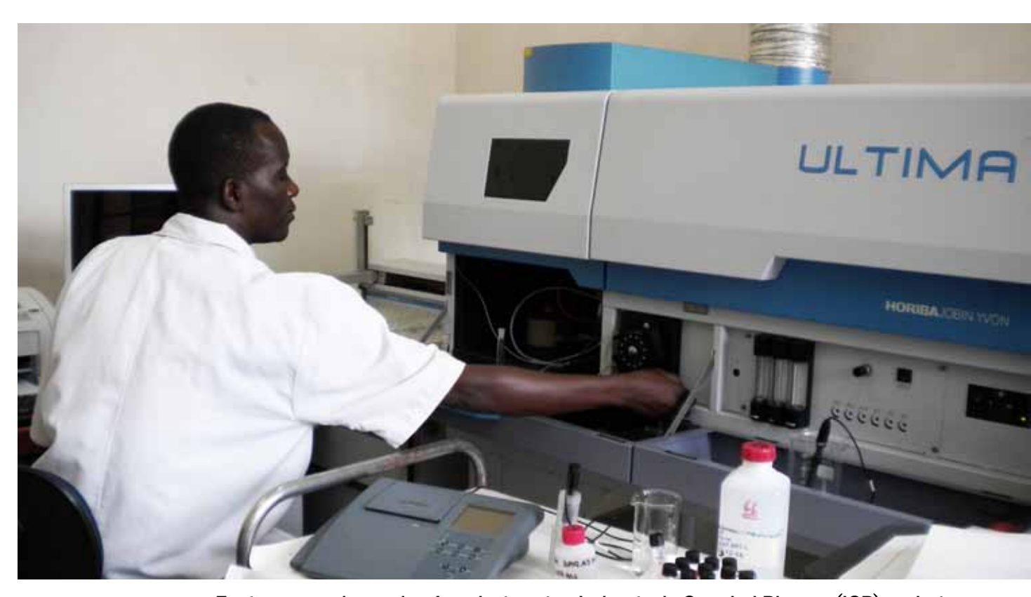
Environmental samples Aanalysis using Inductively Coupled Plasma (ICP) technique

Region. "All the ore deposits in the Great Lakes region will be analysed and entered into a database. Anyone wishing to sell a commodity will be obliged to send it to the laboratory for analysis to be established at SEAMIC. Once the samples are analysed by the LA-ICP-MS analytical technique the results are sent to Burundi to be matched against their master database. The benefits to these governments will be incalculable, and it will be a useful source of revenue for SEAMIC too."