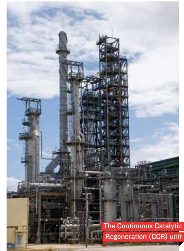
The Continuous Catalytic Regeneration (CCR) unit