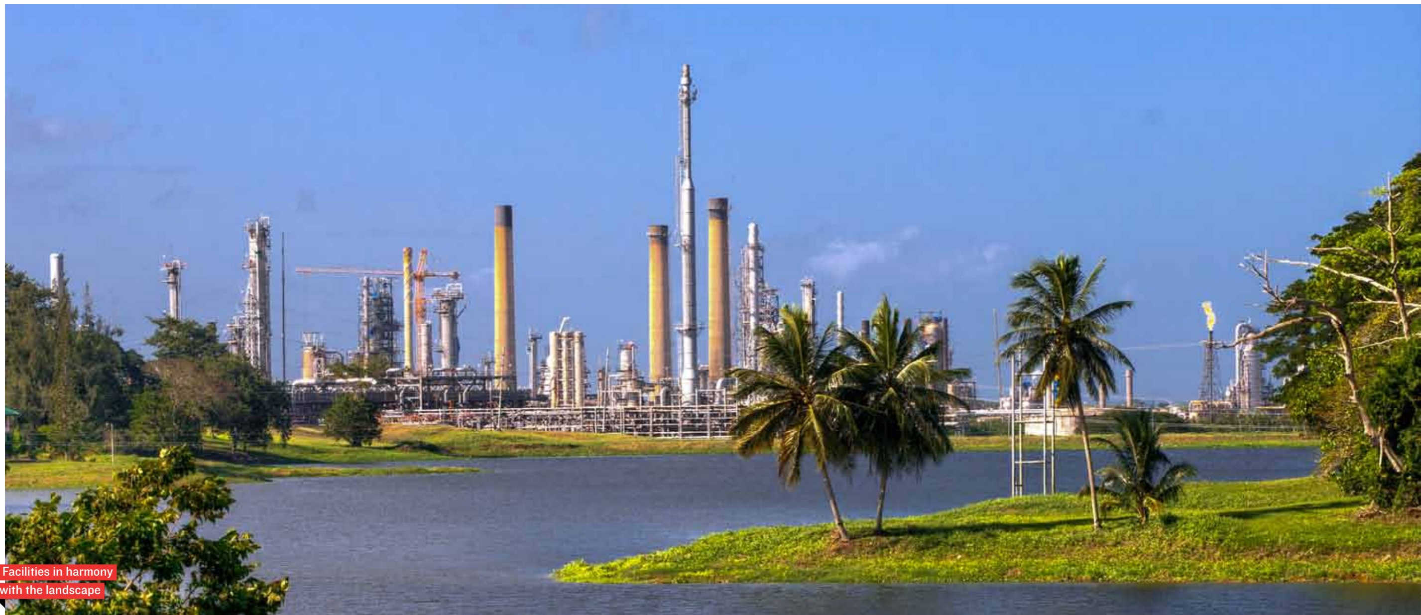
Facilities in harmony with the landscape

L ast year we published an in-depth report on the Caribbean’s leading O&G company, looking at Petrotrin’s business models, vision, people strategy and environmental aspirations. There can be no doubt that this is a company that is pivotal to the development of the nation and indeed the region as a whole. Petrotrin is the state-owned integrated oil and gas company of Trinidad and Tobago engaged in the full range of petroleum operations including the