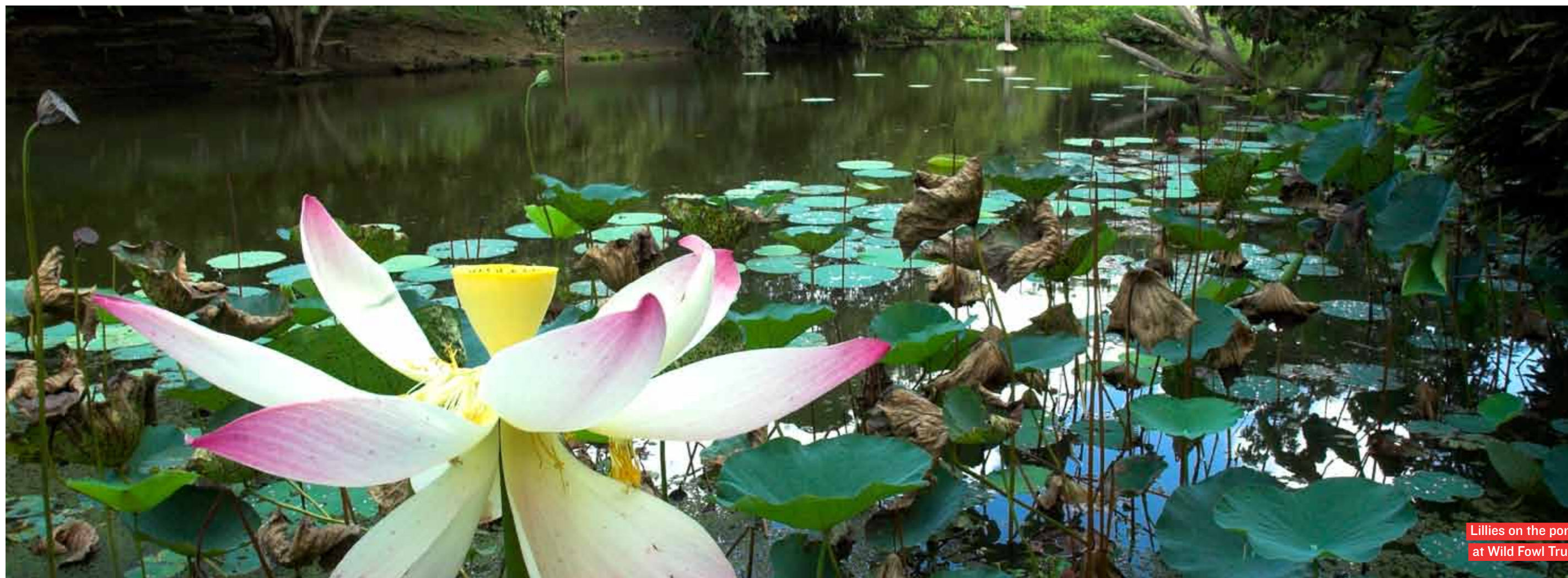
Lillies on the pond at Wild Fowl Trust

“Petrotrin is the major sponsor of the annual Inmates Calypso Competition held in the eight prisons and centres, which the company has been sponsoring for the past 24 years”