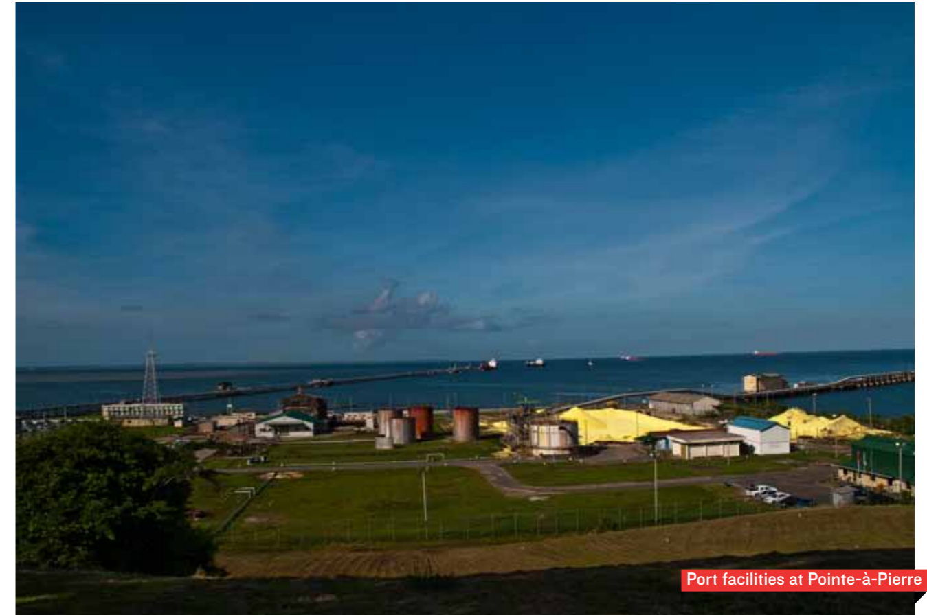
Port facilities at Pointe-à-Pierre

1 868 647 1885, 338 4009, 488 1949, 336 7935, 298 3315