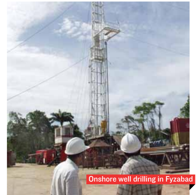
Onshore well drilling in Fyzabad

Basically, Trinidad and Tobago needs more oil, and that means increased exploration activity on the part of Petrotrin and its partners. The company is carrying out an intensive programme of 3D seismological surveying and interpretation which should