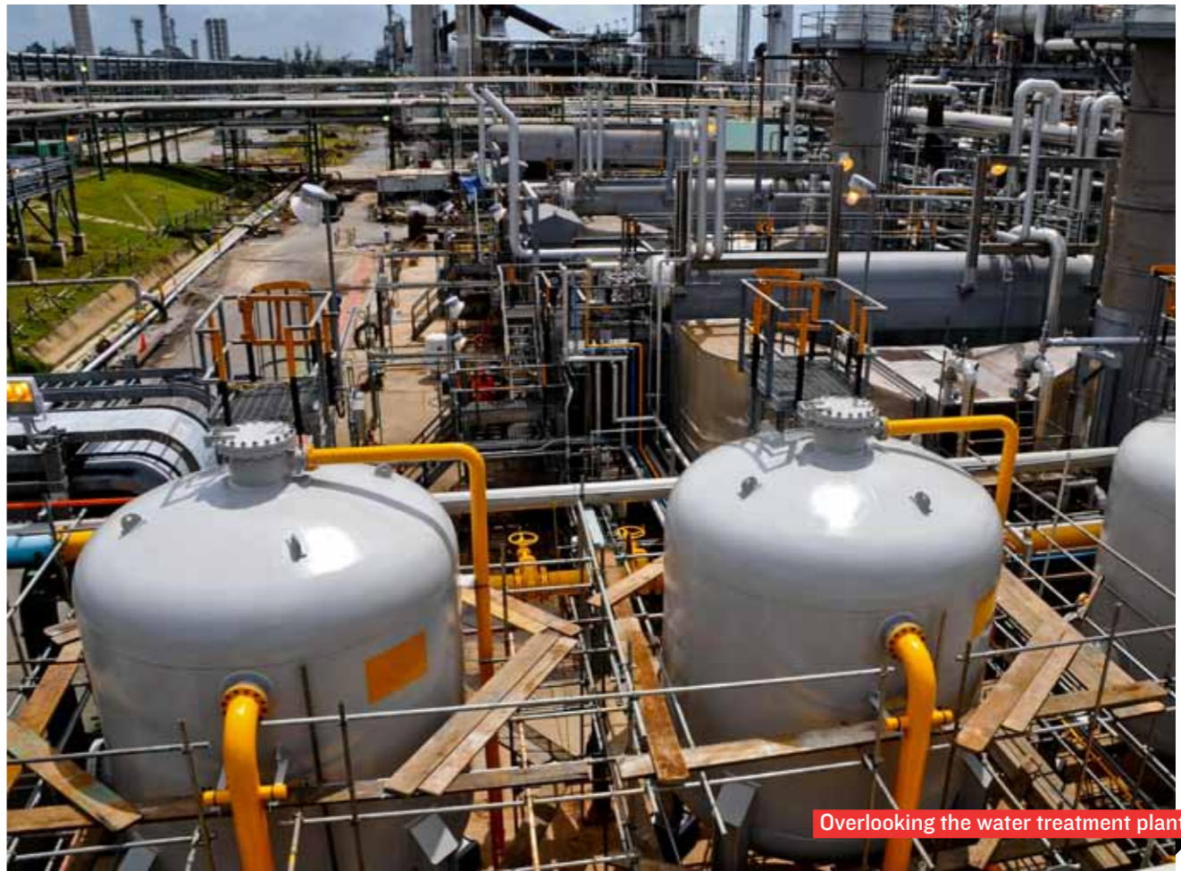
Overlooking the water treatment plant

Sometimes in the waves of change, we find our true direction... Moving forward, breaking new ground. TOSL Engineering Limited