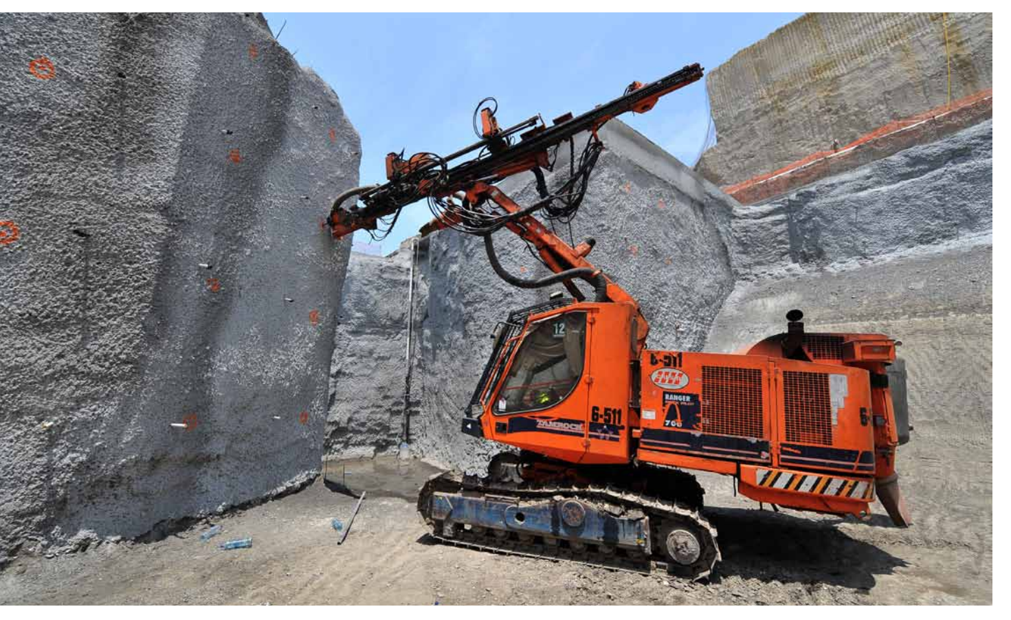
Drilling of Gatun Formation to install rock anchors