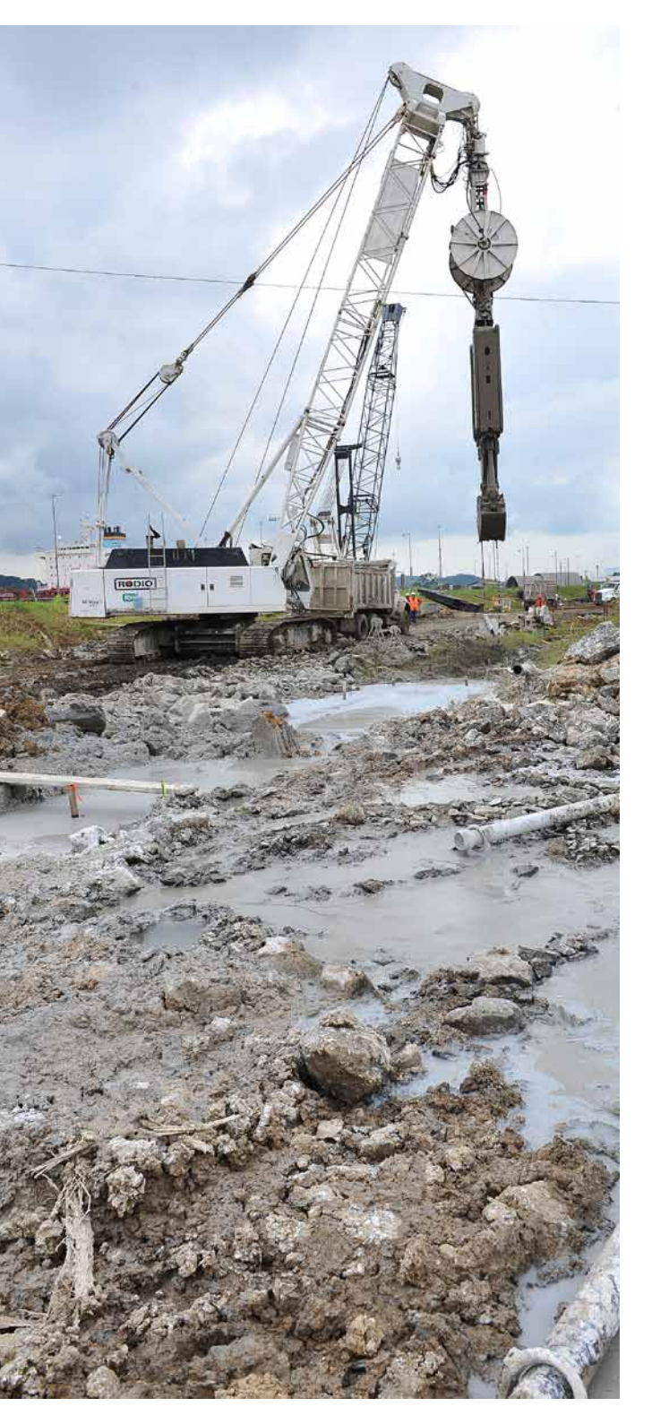
Construction of cement bentonite slurry wall between the northern end of the access channel to the new Pacific Lock and the exiting Pedro Miguel Locks

undertaken by the Mexican-Panamanian consortium Cilsa Panama-Minera Maria. A third contract was awarded in 2008 to Constructora Meco SA. for a total of $36.6 million. All of these works have now been completed.