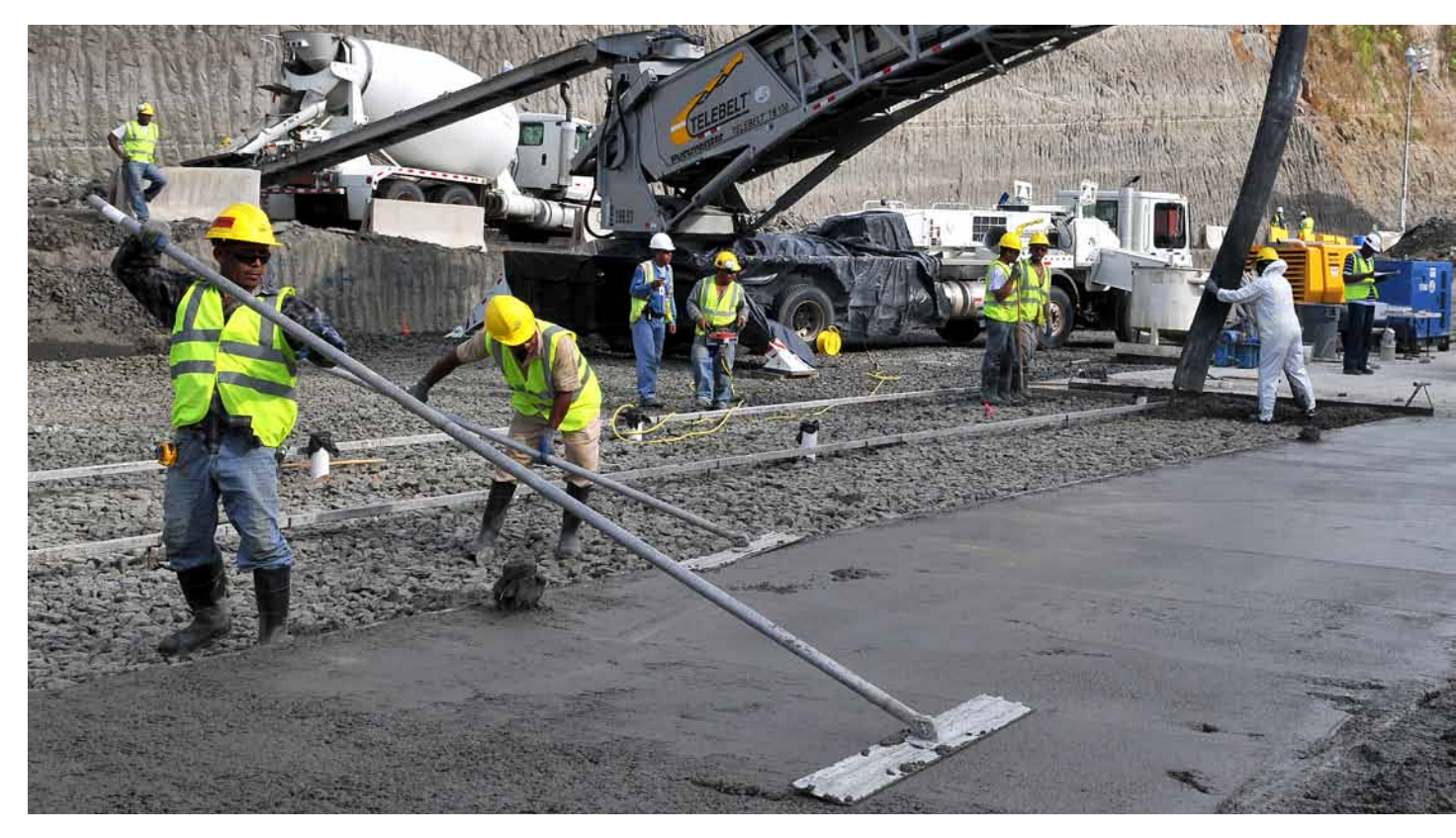
Leveling concrete base being placed so that forms and rebar can be installed effectively over it, and structural marine concrete can later be poured

maximum operating level by 45 centimeters, from its current 26.7 meters to 27.1 meters and will provide additional storage capacity for more than 200 million cubic meters of water in the lake. This project also adds to the draft reliability of the lake.