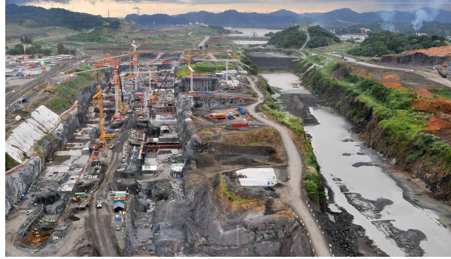
New Pacific Lock construction looking north. In the background is Miraflores lake and the hills that conform the continental divide

His rationale for splitting the excavation of the 6.1 km channel into four contracts is clear. "By designing these projects in discrete elements, it meant we could do the entire excavation program in eight years. We would not have been able to do a full design for the entire length of the channel for another two years which would have meant two years of lost time. Another consideration was that we wanted to start with smaller projects to give local and regional contractors an opportunity to participate. They were able to come up with very good bid prices and as a result we have