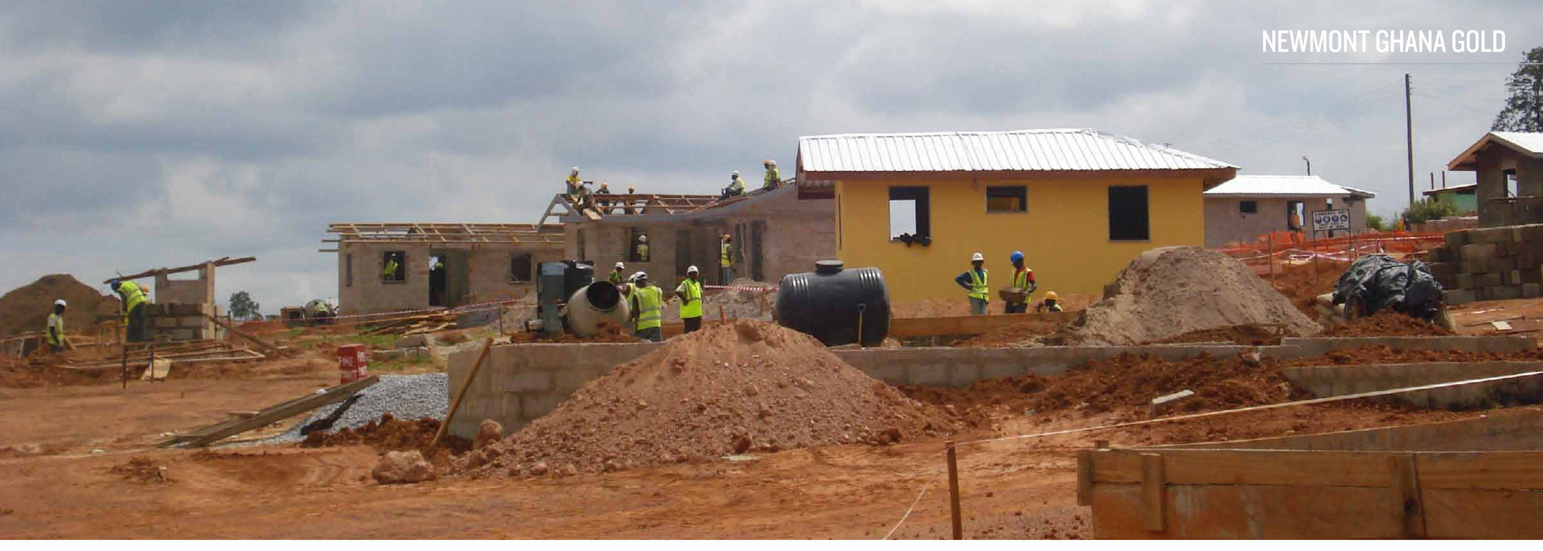
Ahafo local contractor building resettlement housing