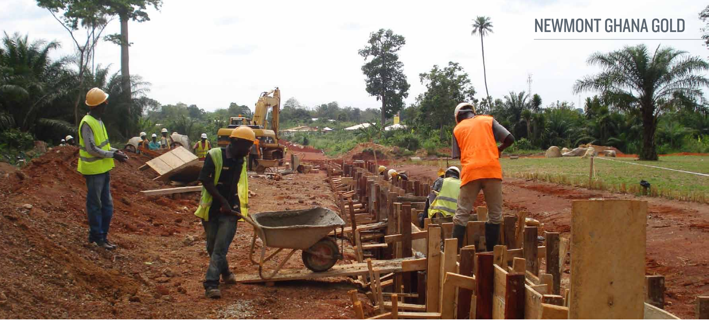
Ahafo local business constructing drainage system at resettlement site

compensation, residents were provided with new homes, schools and titles to land they previously were not allowed to own.