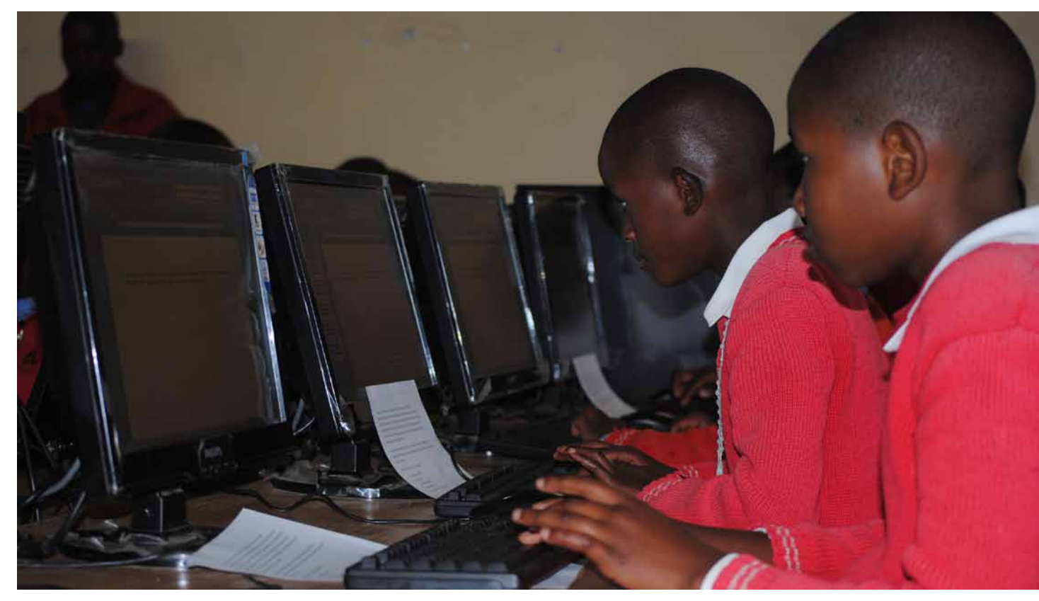
St. Peter's primary school

infrastructure projects that added a further 18 base transmission stations.