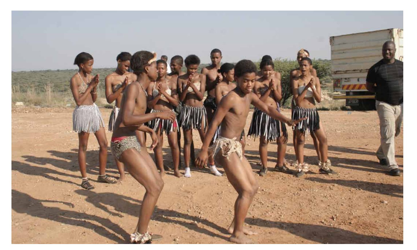
Traditional dancers - Setswana

part of the project includes 5.3 kilometres of railway siding, an automated 3,500 tonnes-per-hour rapid loading station, road trucks with a loading capacity of 300 tonnes per hour, a crushing and screening plant, and storage facilities to handle the mine's residue. Plans are also underway to construct a sintering plant, which will allow the mine to ship out the ore after