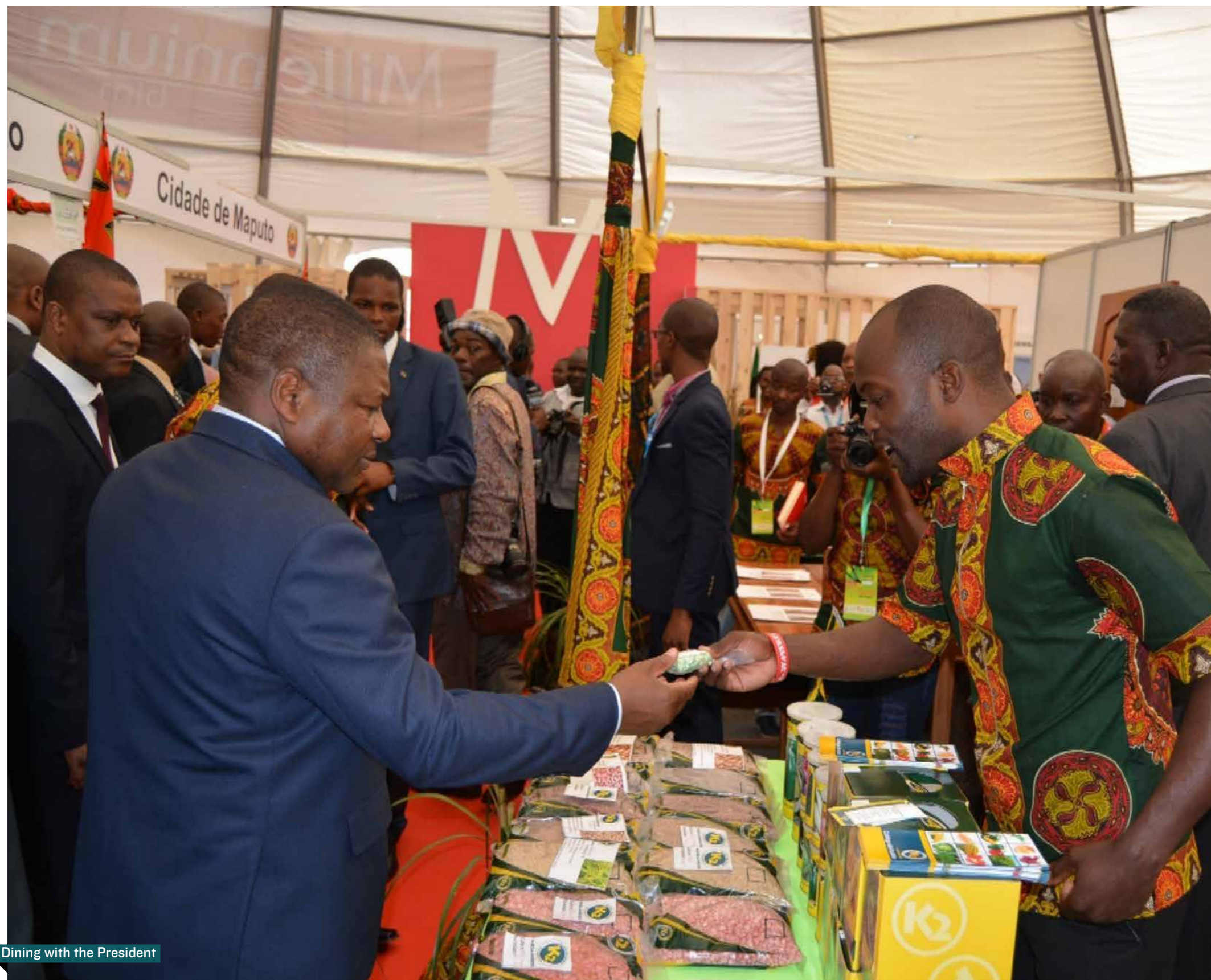
Dining with the President

“In the next 5 years we expect to be the dominant seed company in Mozambique”