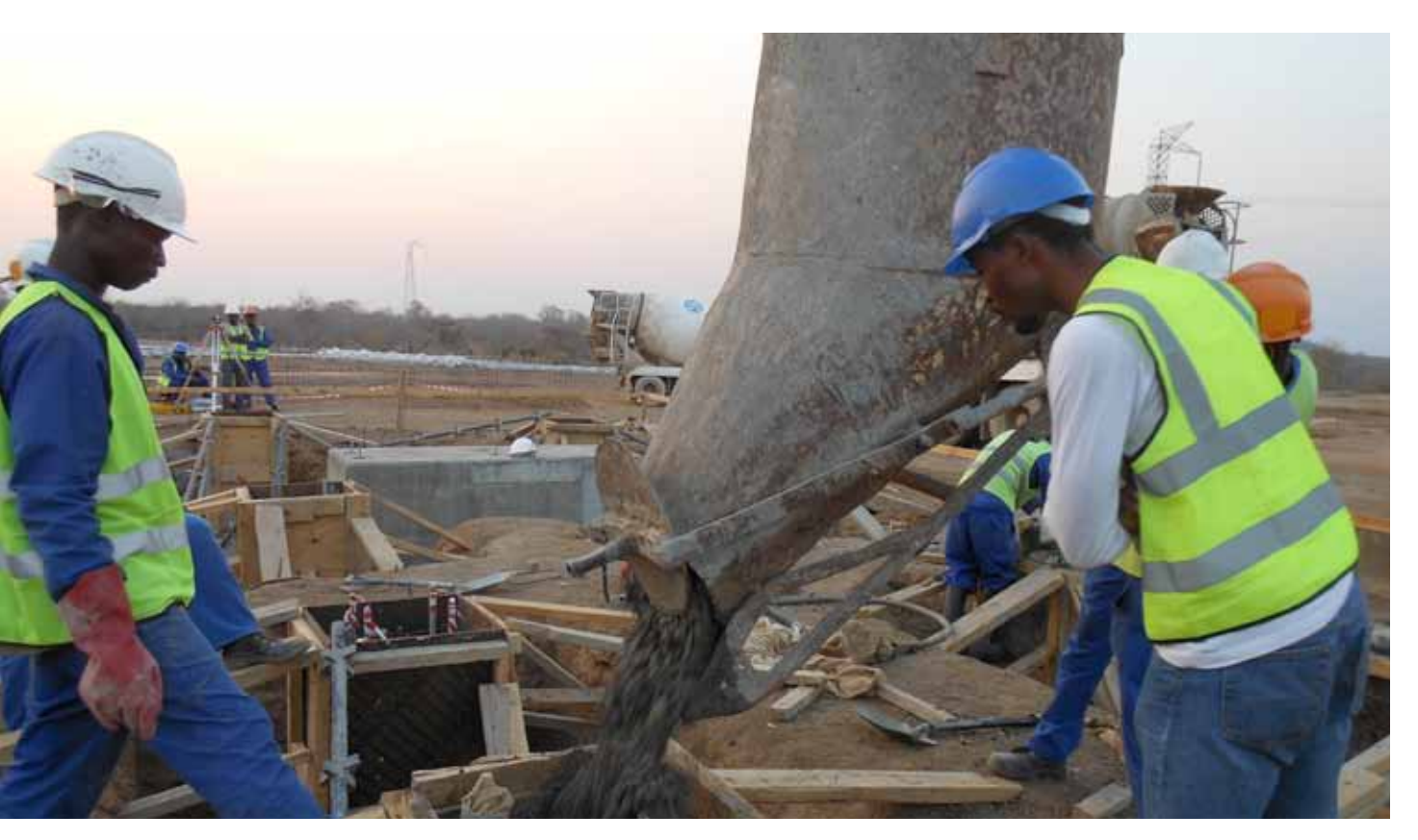
JSPL commissioned a 400 TPH wash plant