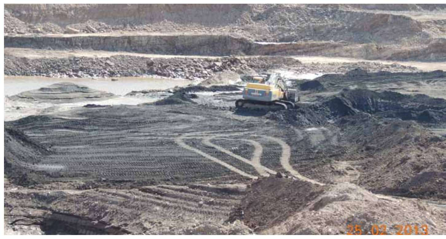
JSPL plan to build a coal-fired power plant

the standards of living in the area in the months and years to come. To date we have donated ambulances to the Tete Hospital to help improve response times, built an on-site clinic, which is accessible to all people from the surrounding area, donated malaria kits to communities and distributed blankets and bed sheets to the Chirodzi Primary Health Centre. We now plan to follow this up with the building of both a primary and secondary school in the near future."