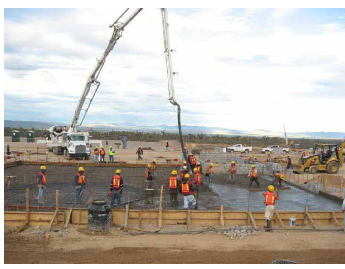
Workers at Peñasquito