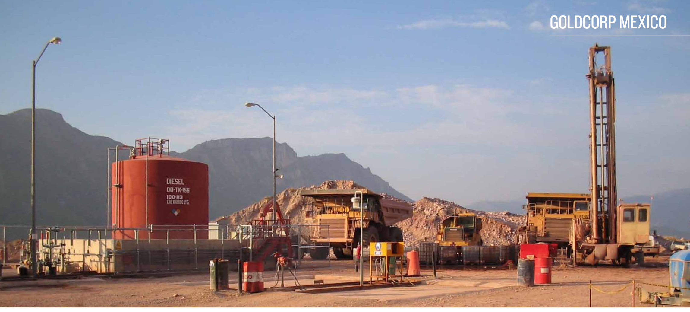
Machinery at El Sauzal

established senior gold producing companies in the world, with a dozen active mines on the Americas. Last year it had revenues of $5.4 billion and is predicting that within five years, gold production will reach 4.2 million ounces—an increase of 70 percent!