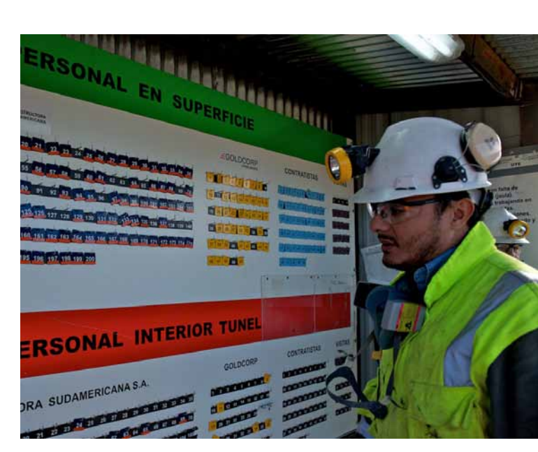
Eureka vein entrance safety board

"THERE ARE A NUMBER OF HIGH GRADE, HIGH QUALITY DEPOSITS HERE MAKING UP A SINGLE PROJECT"