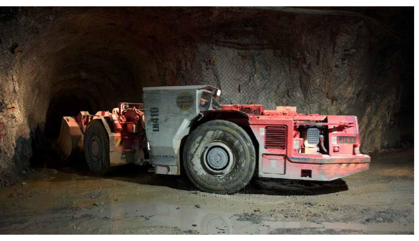
Production inside Eureka

Developing and supporting infrastructure supplying most of the equipment, Still explains. "The idea is that they carry on with the initial underground work, and at the same time we hire and train our own employees, who will become the miners for the extraction phase and continue with the long-term mine development once the main infrastructure is in place."