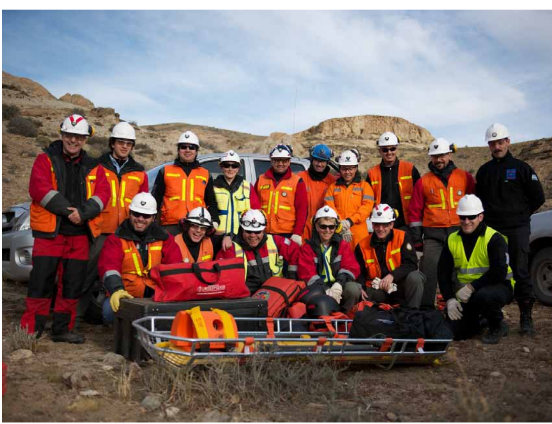
Logistics Inside Eureka Mine rescue team