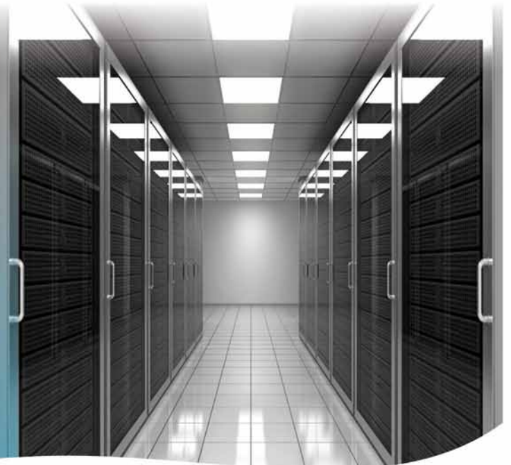
LOCATED @ Osu, Adabraka, Takoradi, Spintex, Kumasi, Dansoman

Offering an international product portfolio with solutions for our corporate clients, Compu - Ghana is well positioned to offer value, exceptional pre-salas and after sales support.