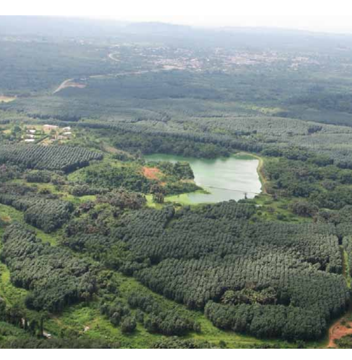
Aerial view of plantation

which is the standard global rate and the price is adapted every month based on this amount. For Ghana, 64 per cent is a good price and allows the farmers to get a monthly revenue for their mature crops of more than $1,000 net. This is quite considerable, as the minimum wage here