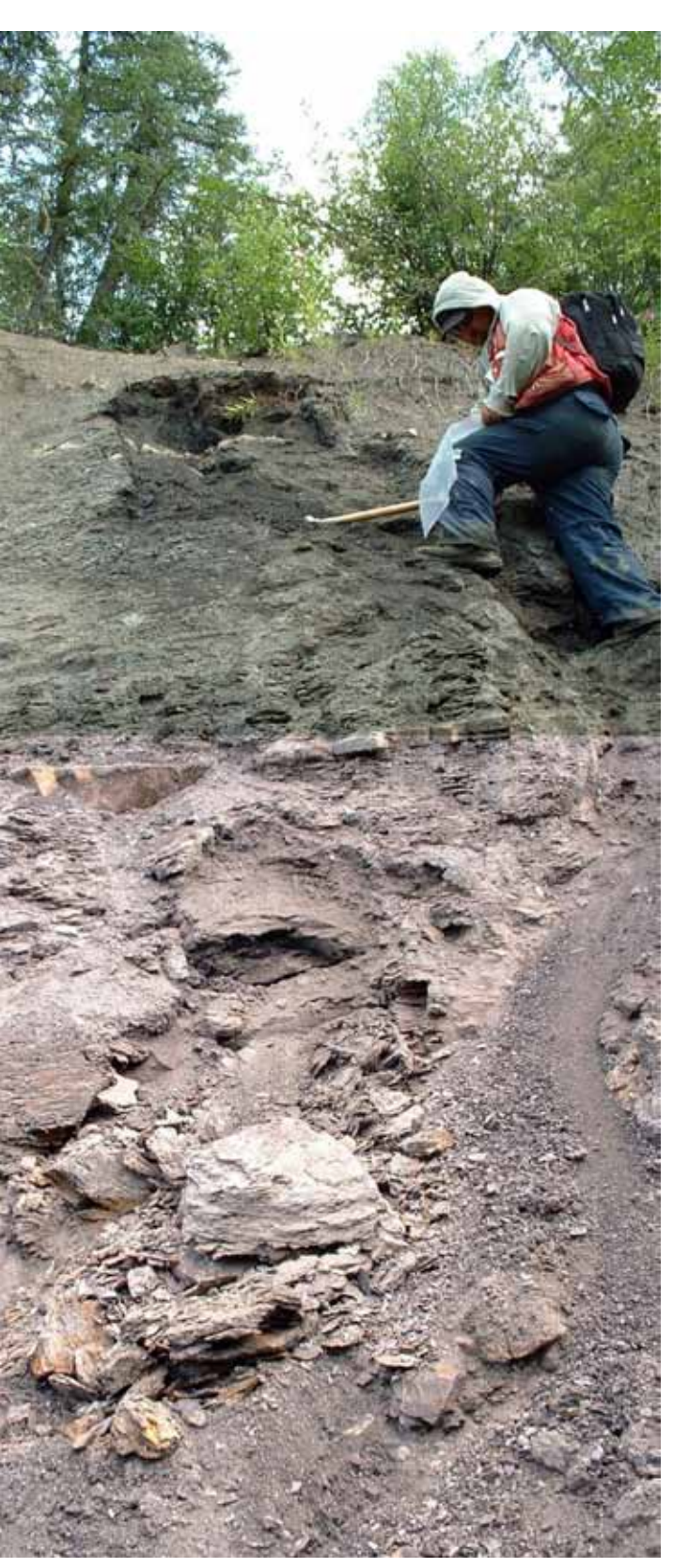
Geo mapping sampling another vertical cliff face outcrop of the black shale