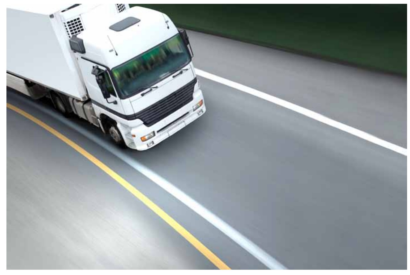
Maintaining the cold chain during transit is fundamental to a brand's reputation