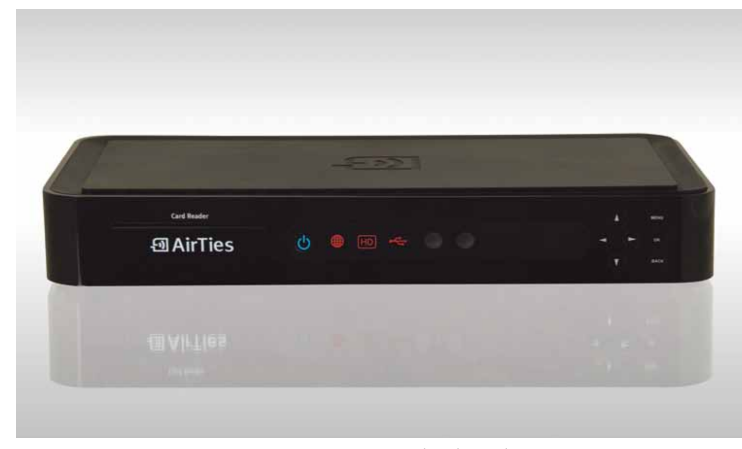
Air 7210 High Definition Hybrid IPTV/OTT/DVB-T/C Set-Top Box with dual tuners

"Today, the fundamental driver of our growth is the fact that our system is designed to guarantee 100 percent wireless coverage